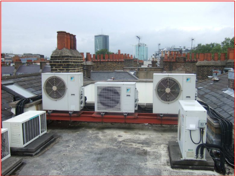
EXISTING CONDENSER MOUNTED ON EXISTING STEELS TO REMAIN.