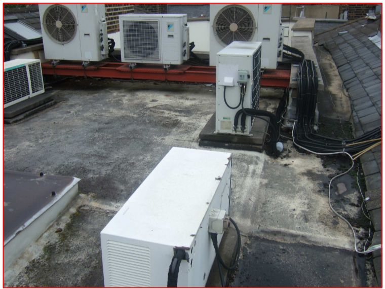
EXISTING CONDENSER MOUNTED ON EXISTING CONCRETE PLATFORM