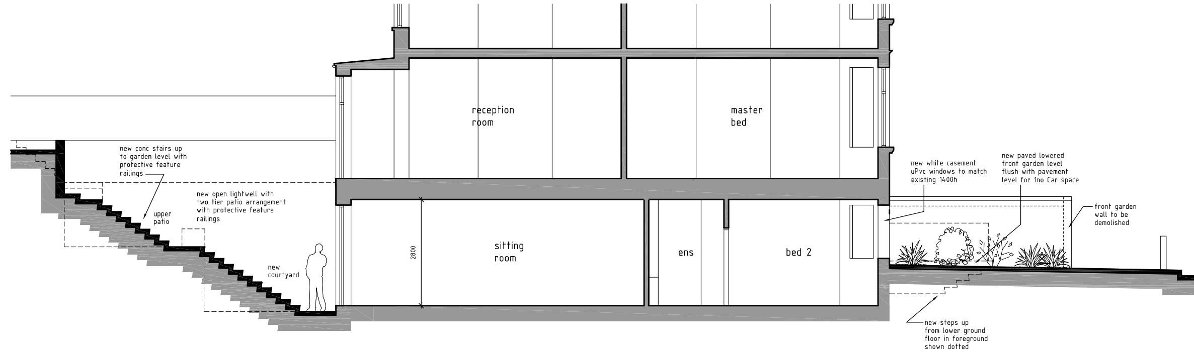
LONGITUDINAL SECTION A-A (AS PROPOSED)