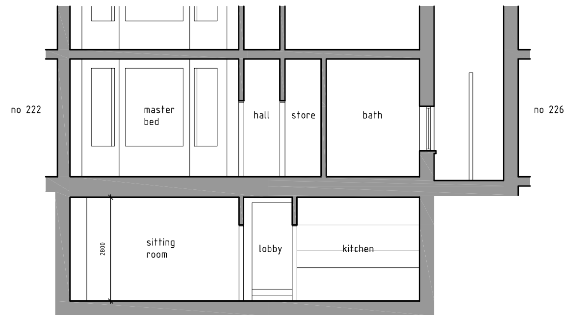
CROSS SECTION B-B (AS PROPOSED)