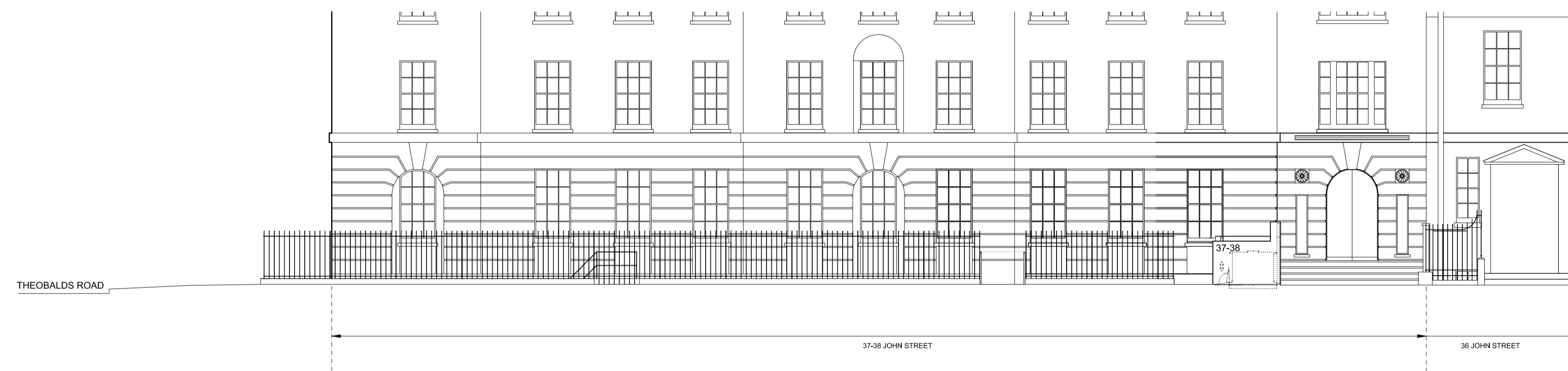
JOHN STREET PART ELEVATION - INCLUDING PAVEMENT LEVEL FENCE

WINDOWS = 144.6 M2 RETAINED EXTERNAL WALLS = 477.2 M2 NEW EXTERNAL WALLS = 6.5 M2