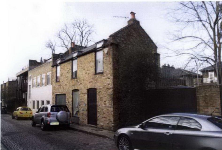
view of 41 camden mews

The house is part of a street scene that is varied in character ranging from original Georgian properties, period properties with modern interventions through to contemporary one-off house. This obvious variety creates a very distinct and appealing character.