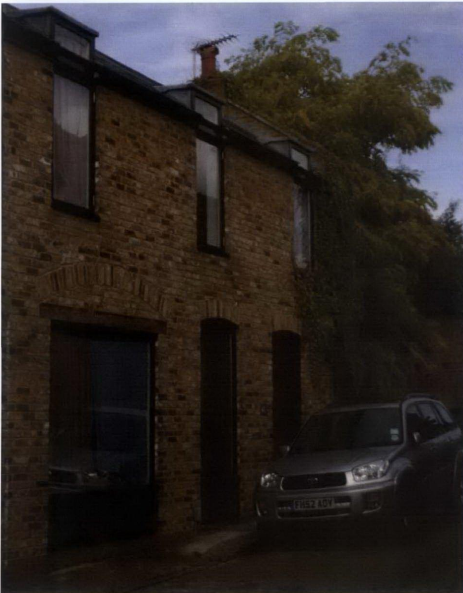
view of 41 camden mews showing materials: london stock brick, timber painted windows, eternit slate tiles & lead

All accesses arrangements to the property will be unaltered.