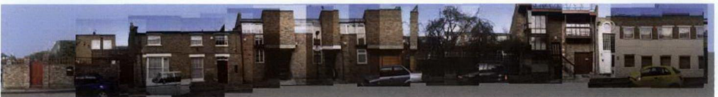
part elevation of Camden Mews