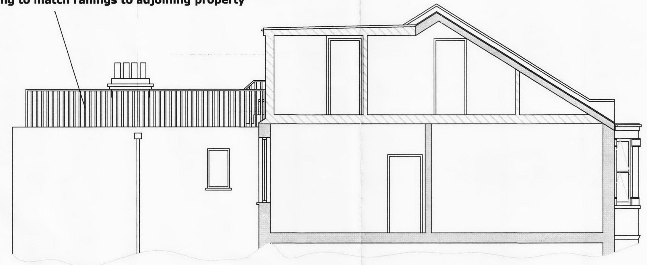
Proposed Section B-B

Railing to match railings to adjoining property