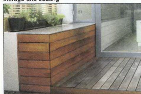
Timber boxes along both boundary fences. Approximately 600mm high, to be used for storage and seating