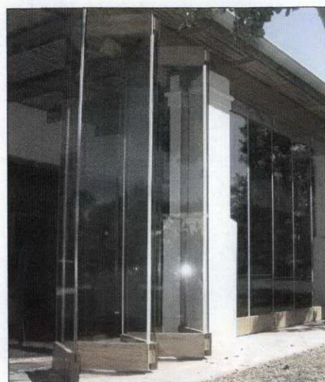
Folding frameless door in 4 sections to both extensions to allow full opening of aperture