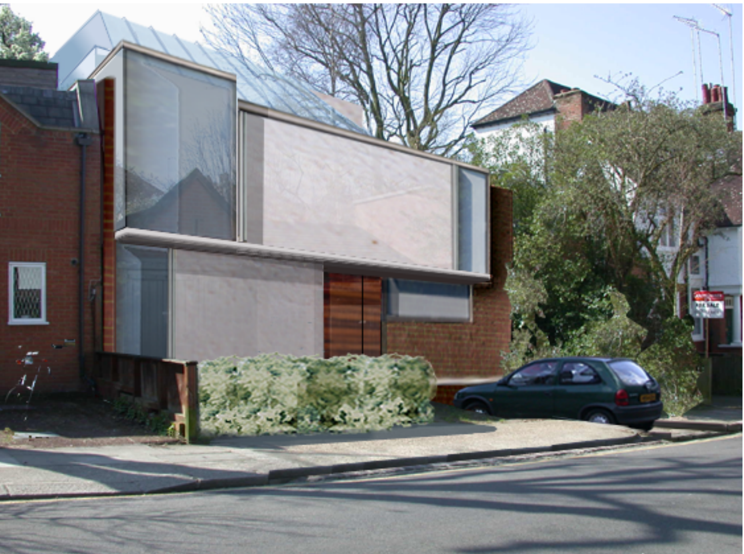
Perspective showing front of new house from across the street