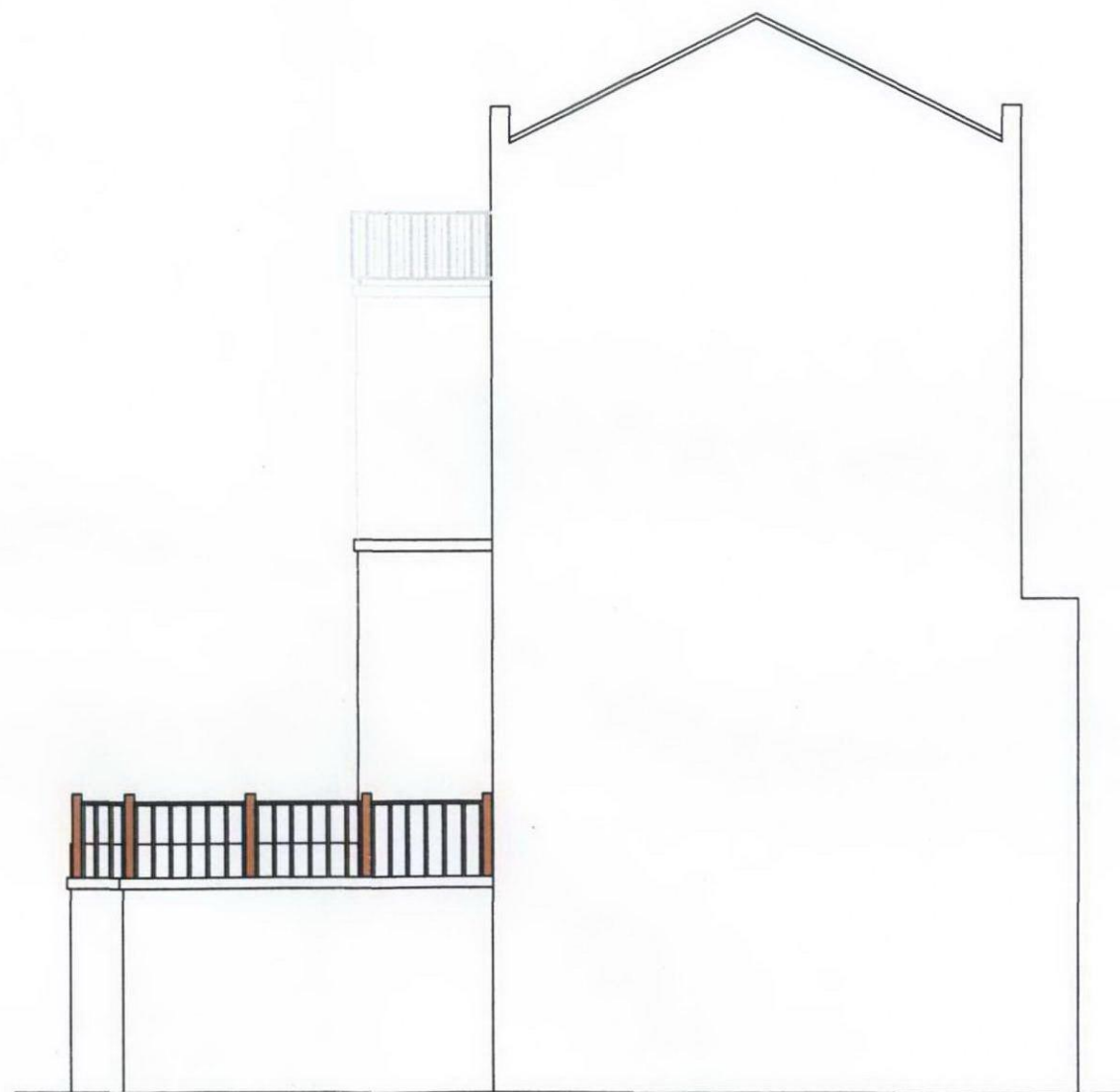
PROPOSED SIDE ELEVATION (EAST)