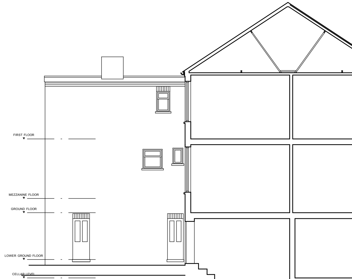
existing side elevation & section