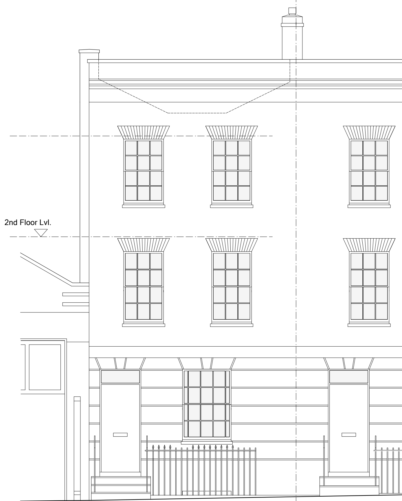
Existing Front Elevation scale 1:50@A3