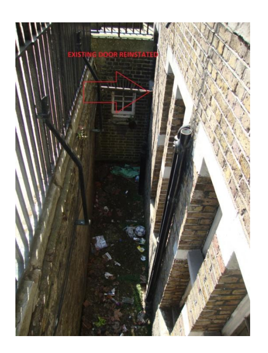
Photo of void proposed to contain Free-standing steel access stair.