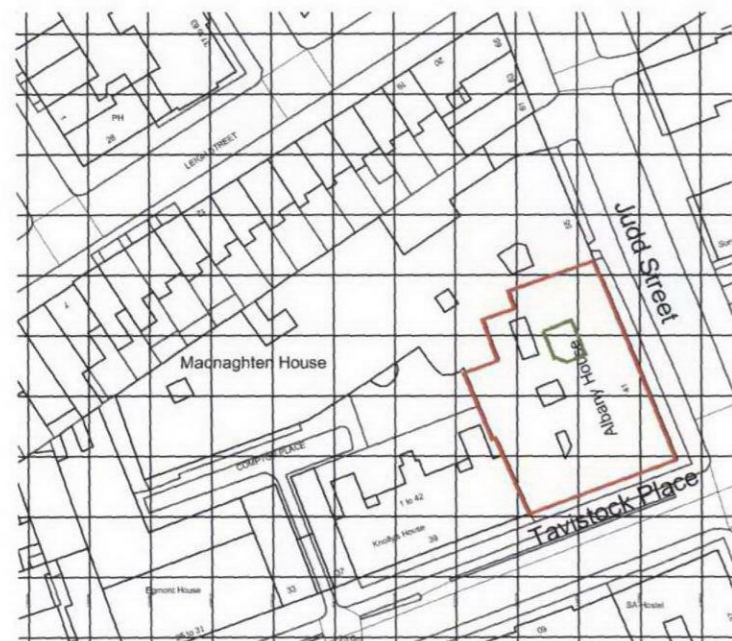
Site Plan 1:1250@A3