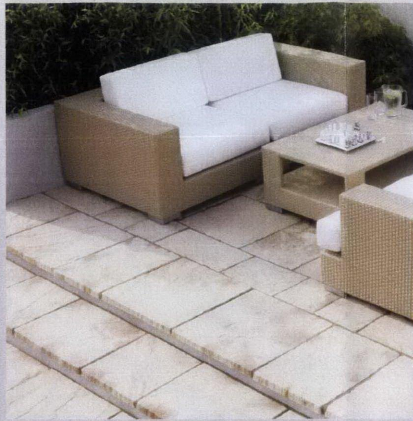
Sawn York Buff Natural Stone Flags Available from Hardscapes tel: 01204 590666 or similar. Approved.