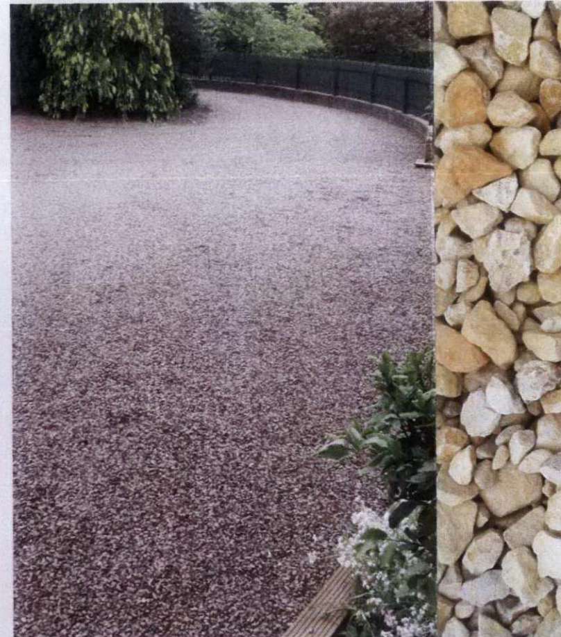
Cotswold Aggregate 30mm depth - particle size 10-20mm Available from Lee's Growers Supplies tel: 01565 650437