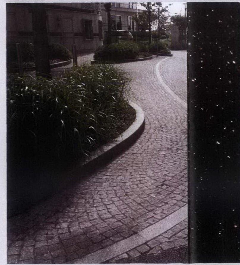
Black Granite Sett Edge 100x100x100