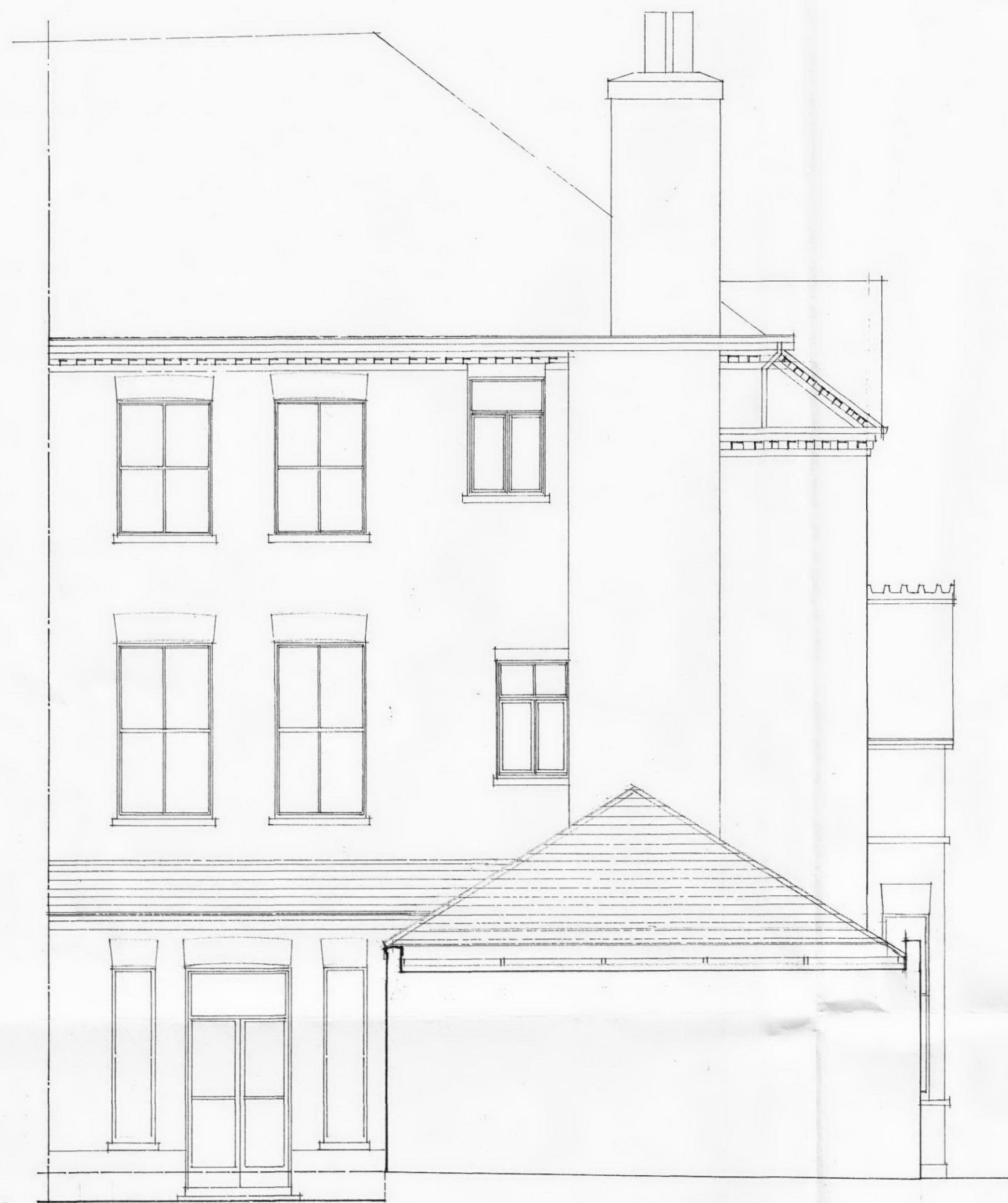
REAR ELEVATION. BB.