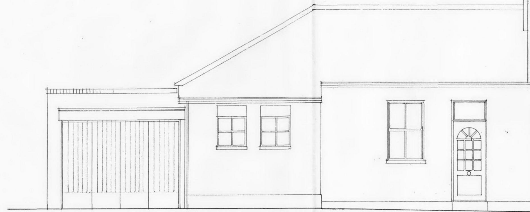
SIDE ELEVATION. CC.