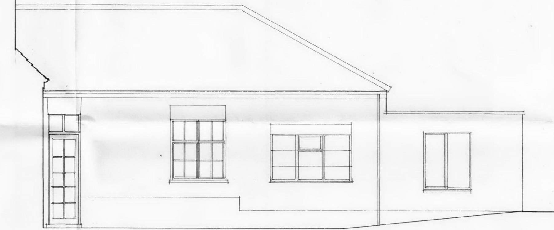
REAR SIDE ELEVATION. AA.