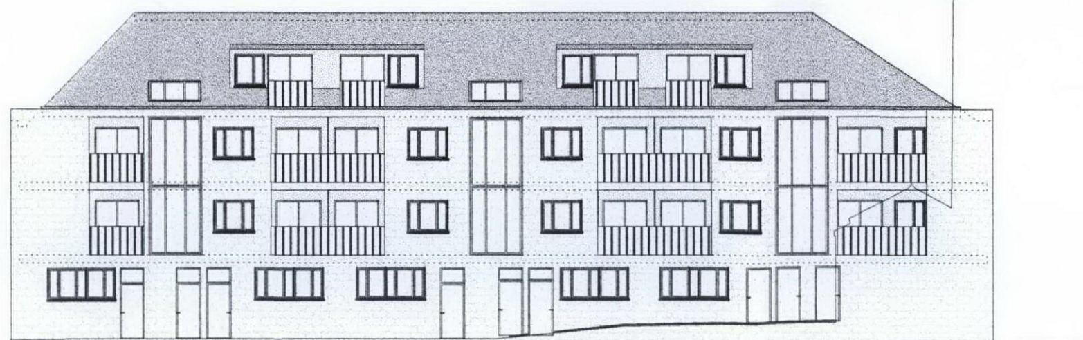
PROPOSED SECTIONAL ELEVATION AA