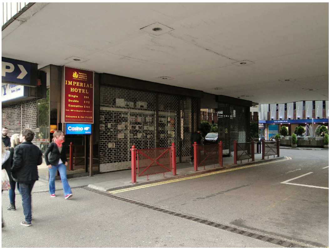
Photographs of Existing Russell Square Elevation