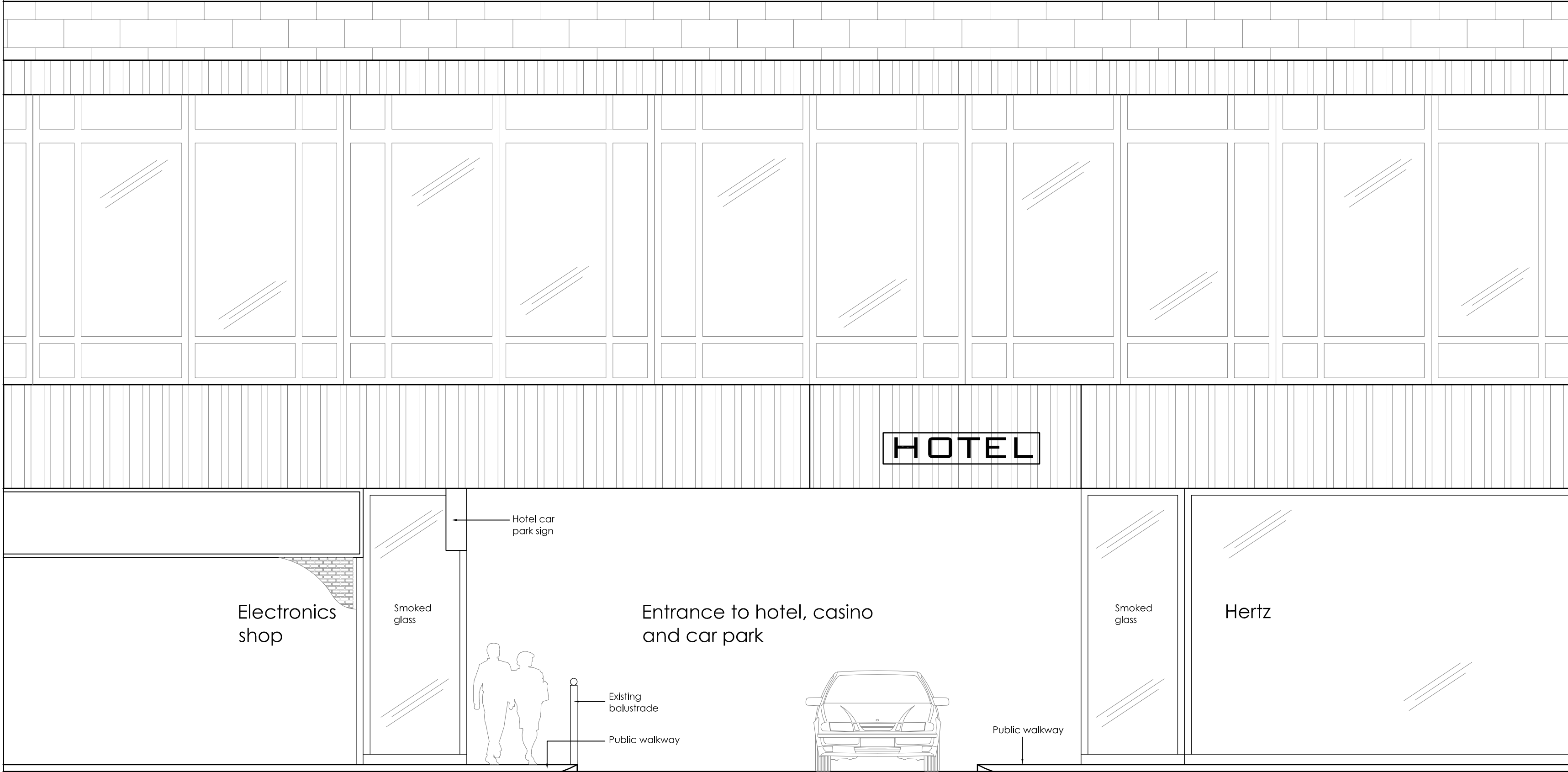
Existing Russell Square Elevation A Scale 1:50 @ A1

this drawing remains the property of fisch design limited and duplication of this drawing in whole or any part is strictly forbidden without prior written permission from fisch design ltd all structural alterations are to be approved by a structural engineer do not scale from this drawing, all dimensions to be checked on site