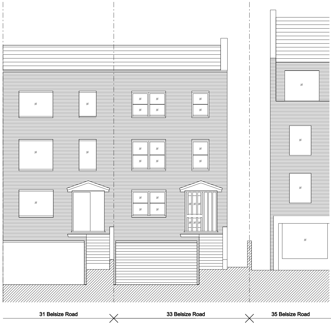
33 BELSIZE ROAD FRONT ELEVATION