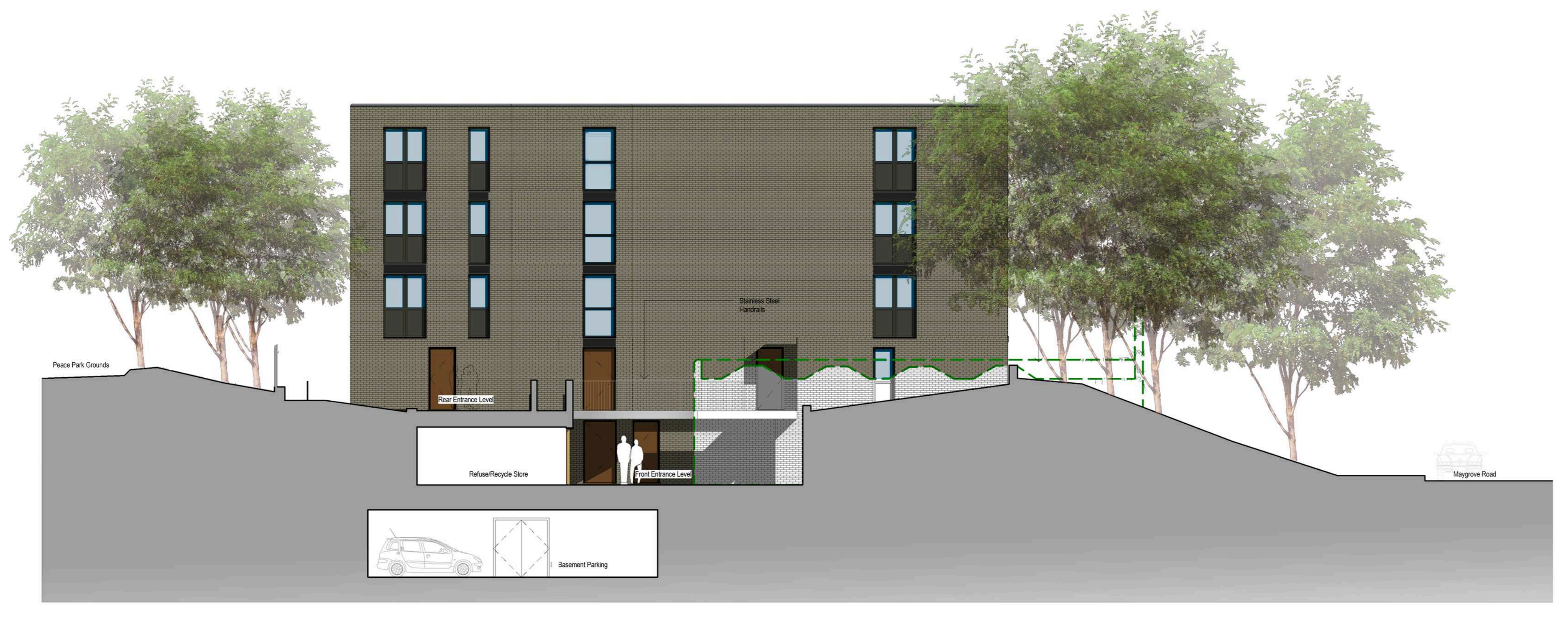
2 WEST ELEVATION