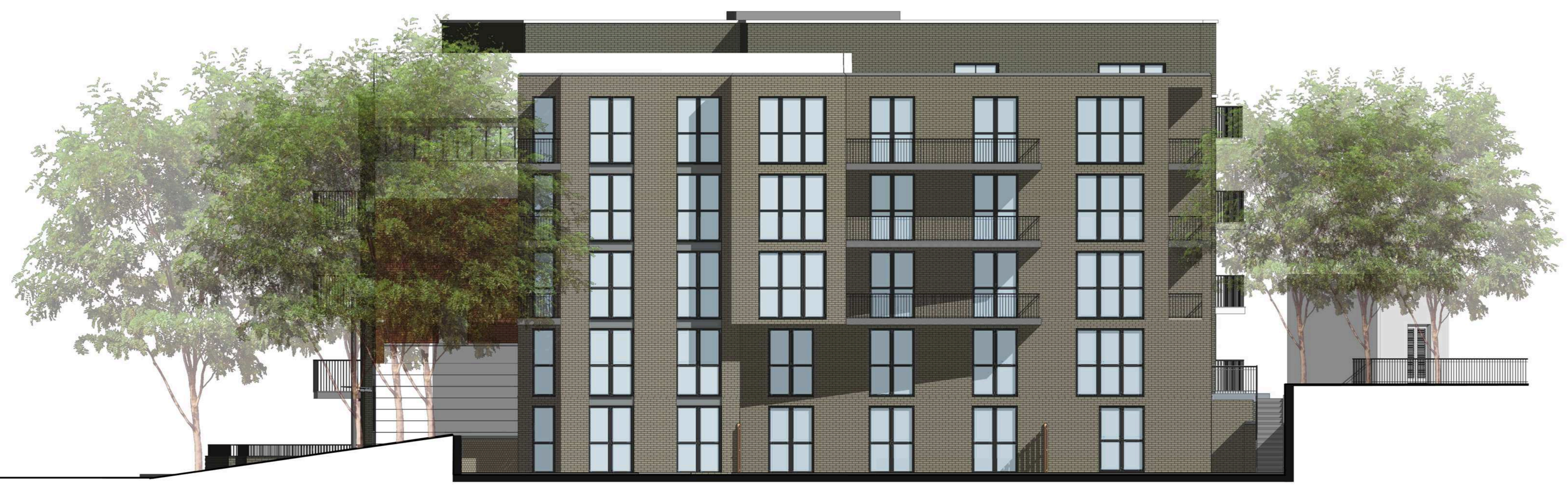
1 EAST ELEVATION 1 : 100