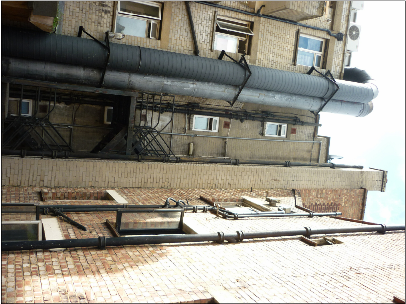
Photograph of rear of 15-17 Goodge St