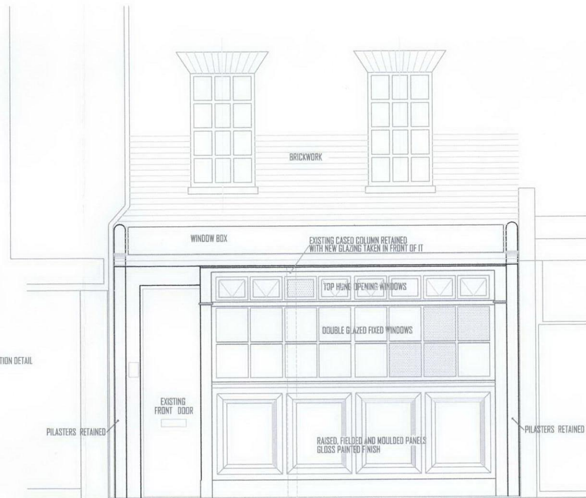
FRONT ELEVATION AS PROPOSED DECEMBER 2011