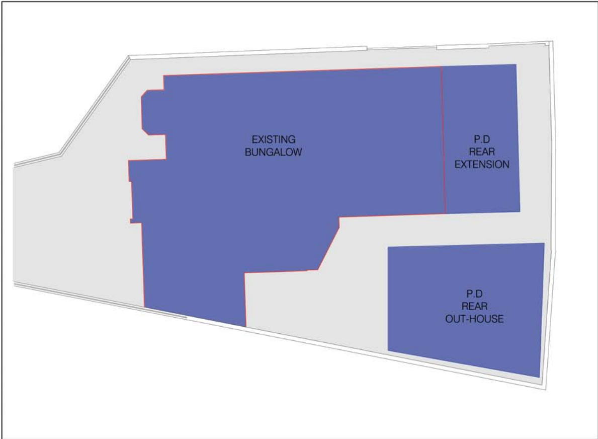
01 EXISTING AND PERMITTED DEVELOPMENT BUILT SITE COVERAGE - 250.8SQM SCALE: 1:100 @ A1