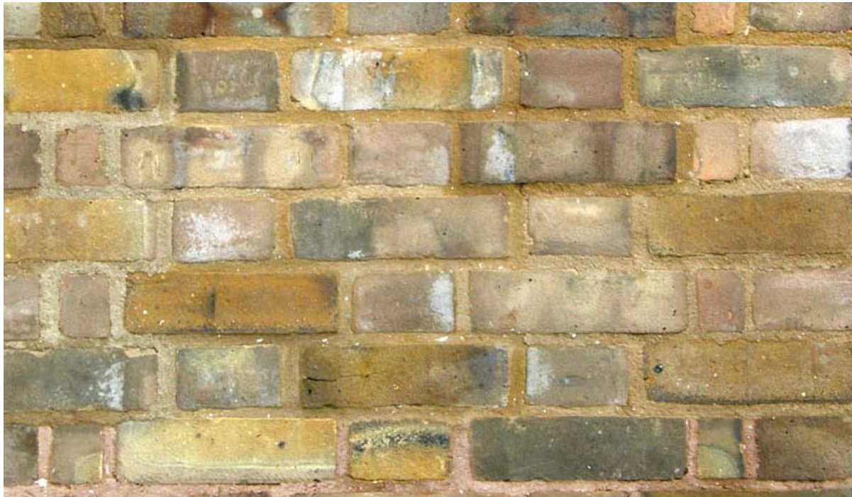
Photograph of site sample panel of facing brickwork

5 parts sieved and washed building sand, 1 part Lime, 1 part Lafarge General Purpose Cement, 1/4 part of Cement Tone Russet Brown Mortar Dye, flush pointed then brushed to expose aggregate.