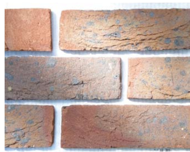
Image of Brick: NB this is as approved for the repair and alterations to the property boundary walls