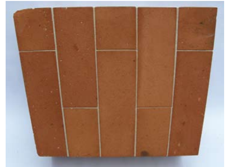
Arches: Rubbed and gauged Bovingdon Selected Light Multi Imperial cut by Apex Brickcutters Ltd