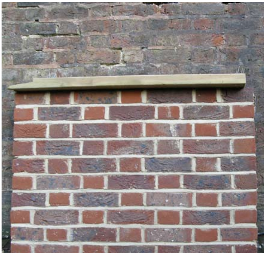
Sample panel erected on site behind existing garage.

Pointing: 1 part hydraulic lime (NHL 3.5), 3 parts sieved, washed sharp sand. Flush pointed then brushed to expose aggregate