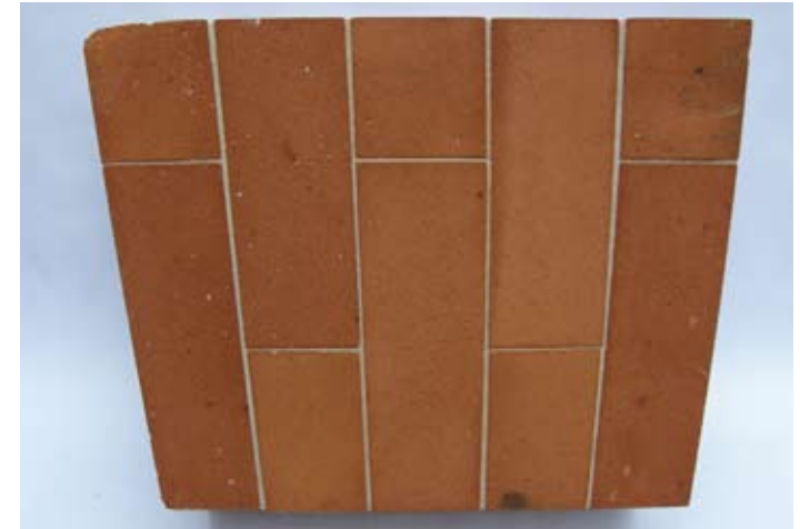
Arches: Rubbed and gauged Bovingdon Selected Light Multi Imperial cut by Apex Brickcutters Ltd