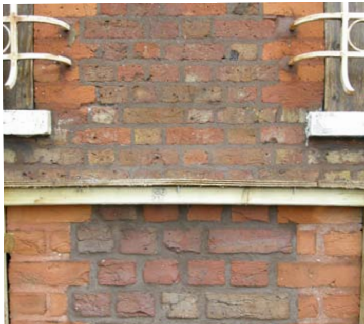
Existing brickwork (above) with Sample panel (below)