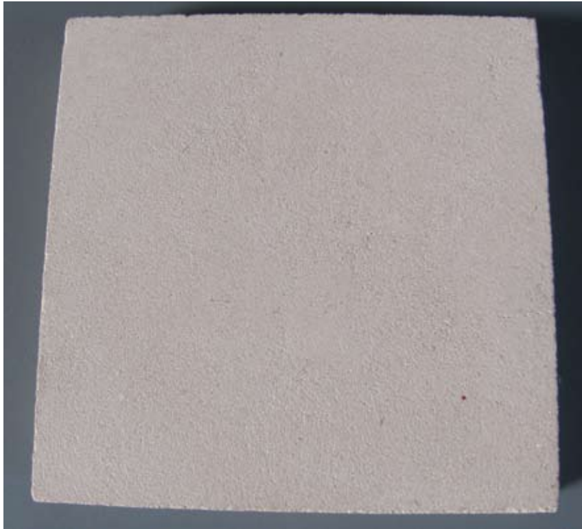
Front of submitted Portland stone sample

Portland Stone from the Perryfield Quarry. Supplied by A F Jones Stonemasons, 33 Bedford Road Reading RG1 7EX 0118 957 3537