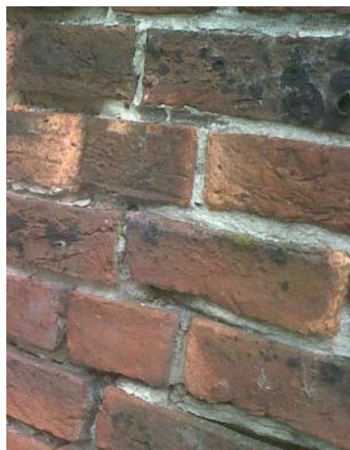
Existing Boundary wall brickwork