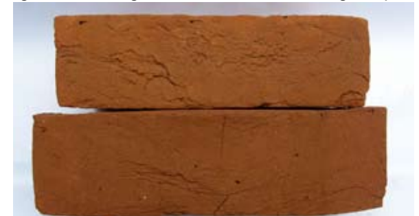
Detail (quoins etc): Bovingdon Selected Light Multit Imperial