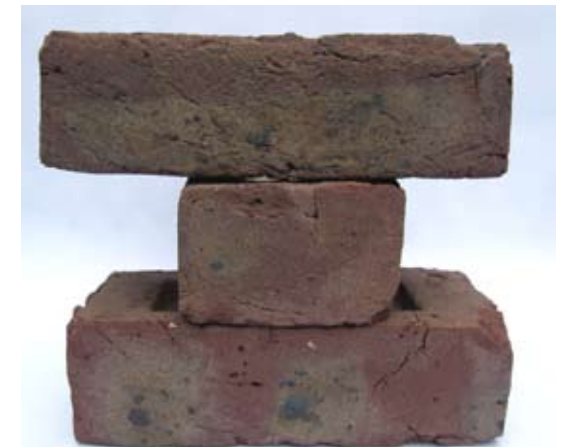
Main facing brick: Bovingdon Handmade Mid Range Imperial