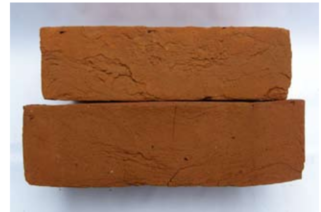
Arches: Bovingdon Selected Light Multi Imperial