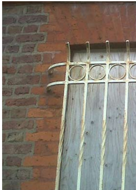
Existing brickwork quoins and arch