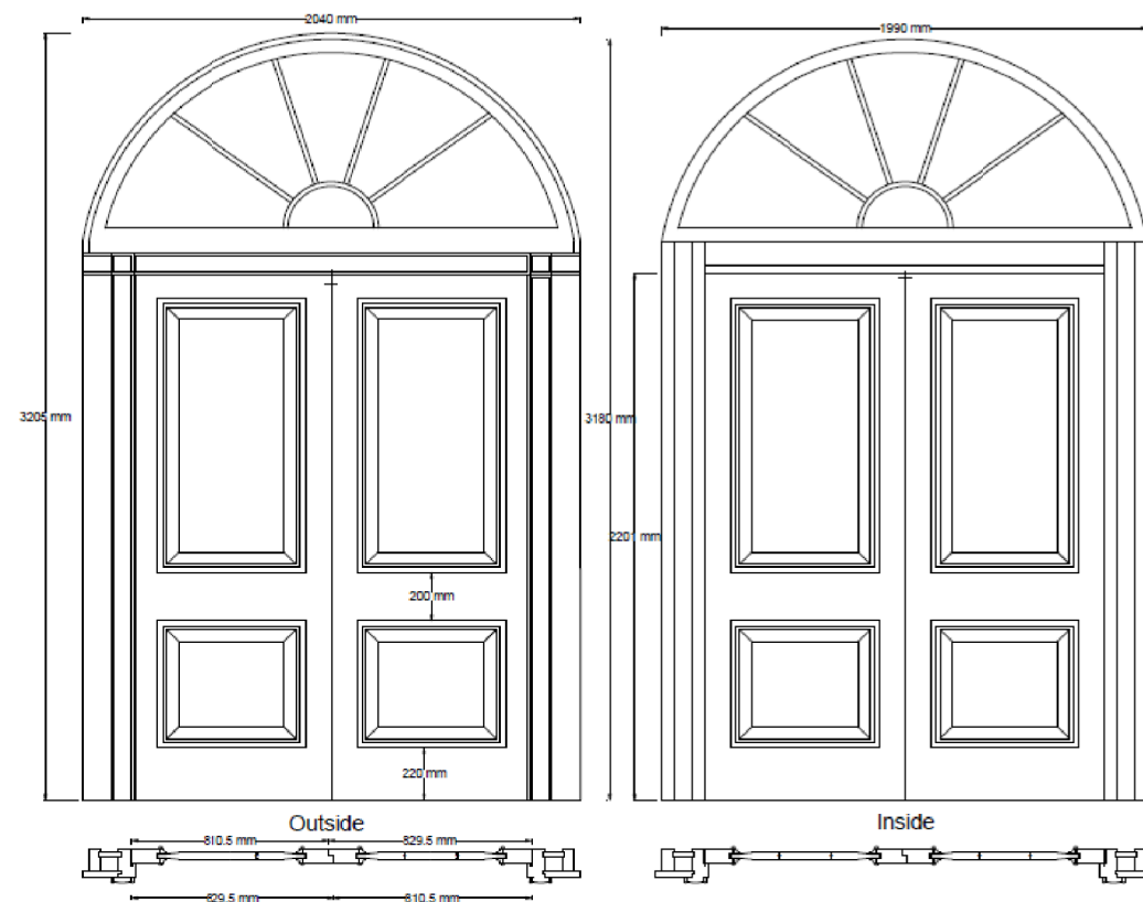
TYPICAL FRONT DOOR ELEVATION