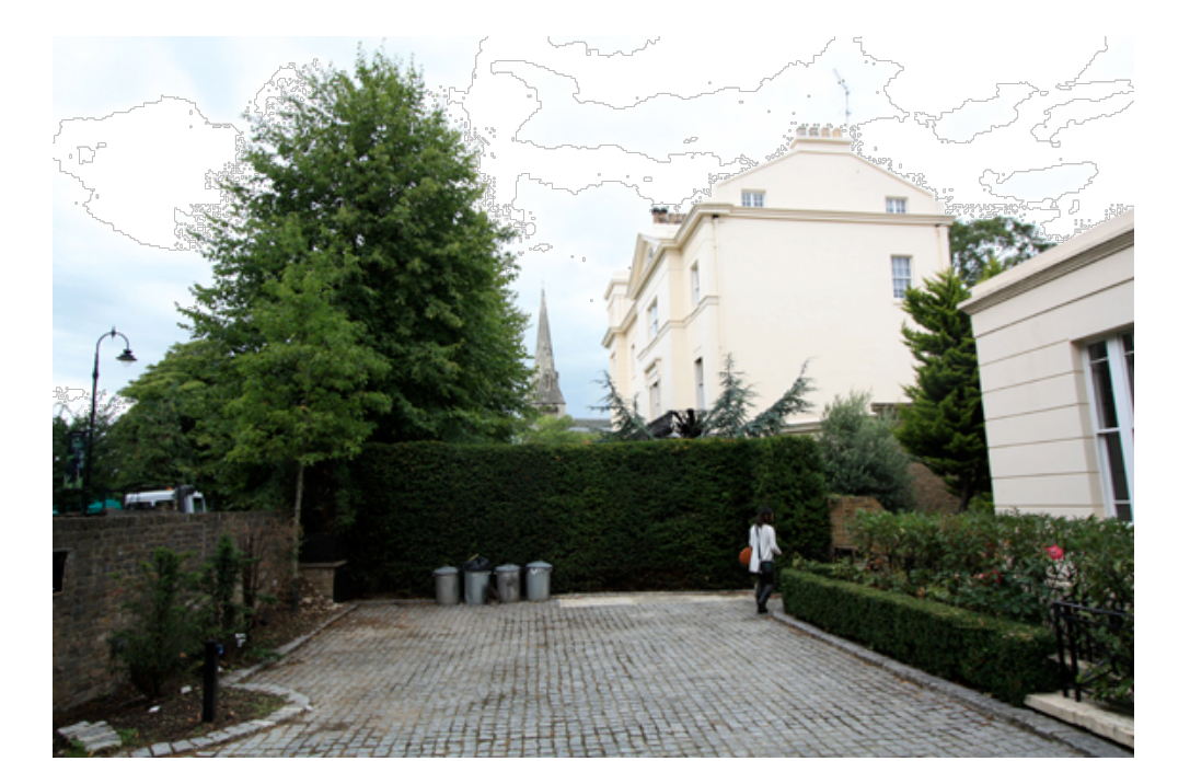
Front Drive Way - Looking West