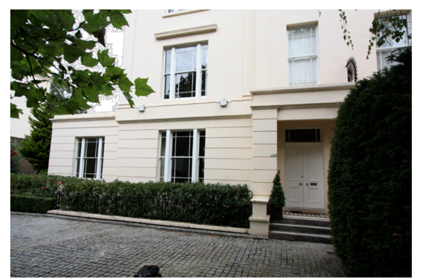
Front Elevation - Entrance