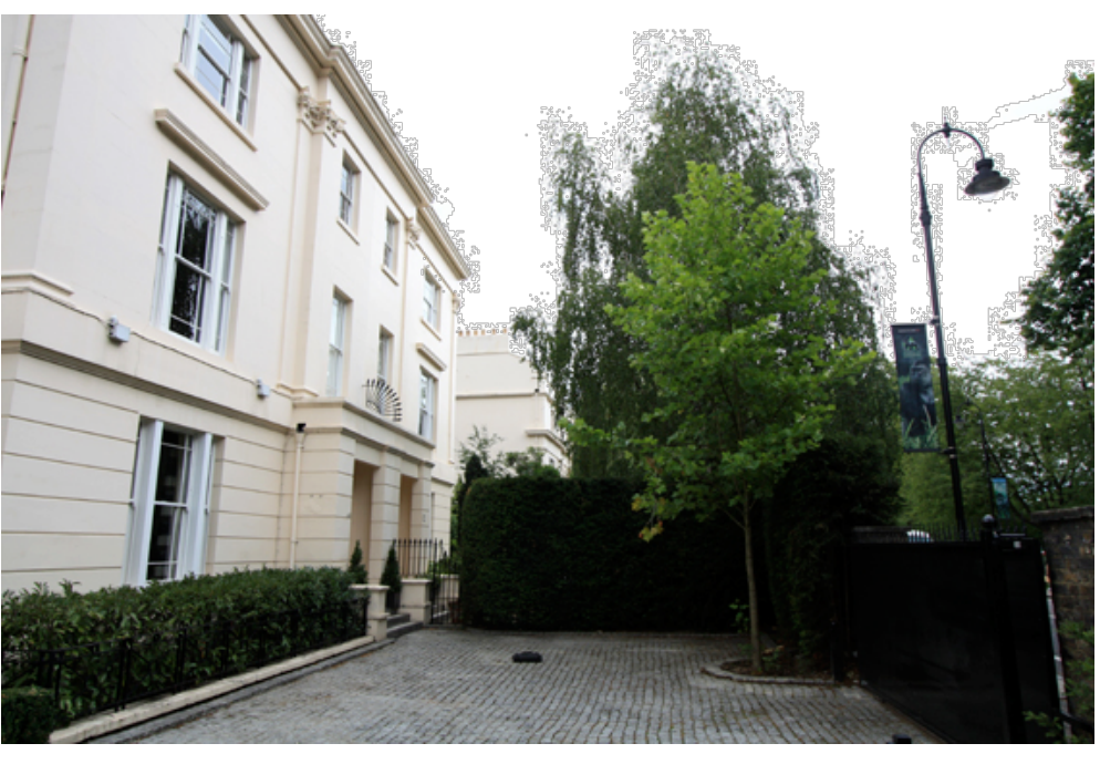
Front Drive Way - Looking East