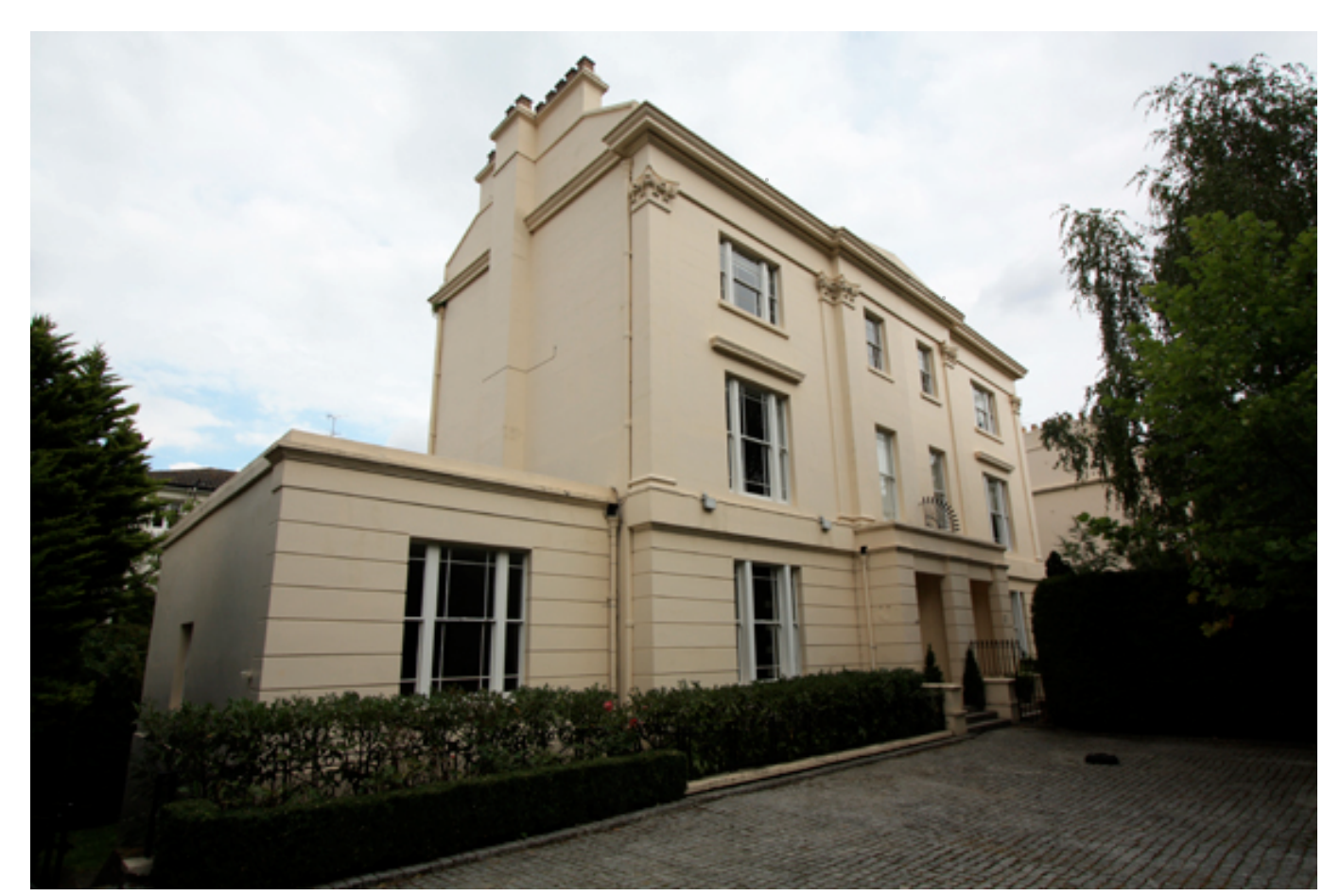
13 Prince Albert Road - Front elevation