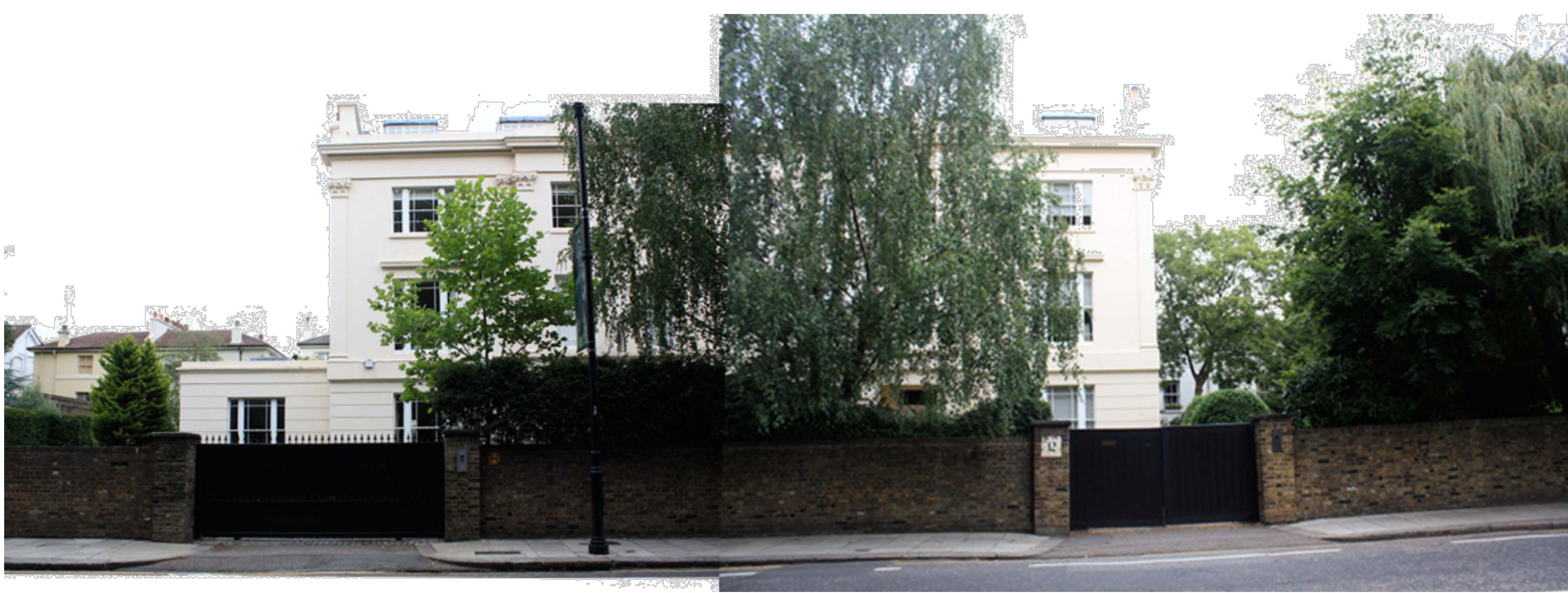
12-13 Prince Albert Road - Street View