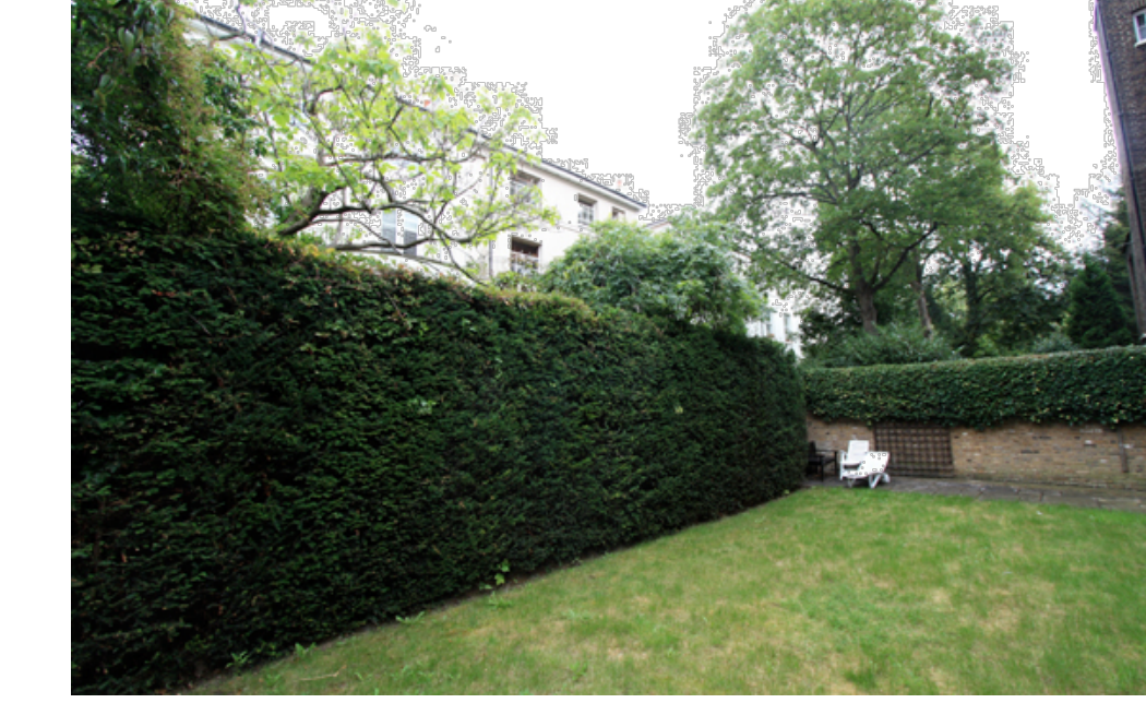
Rear Garden - Looking East