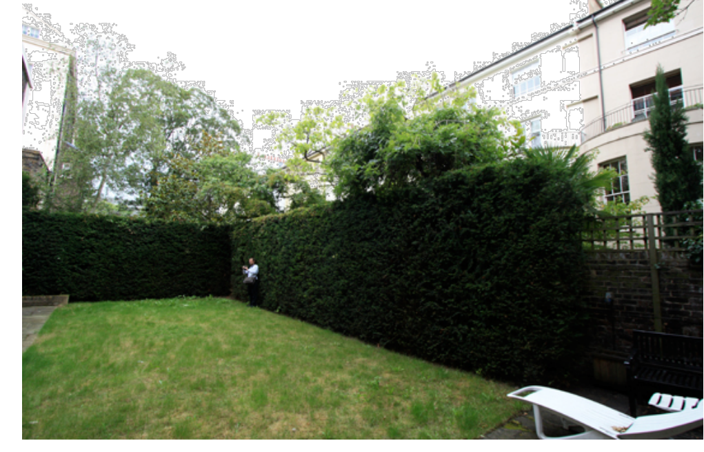
Rear Garden - Looking West