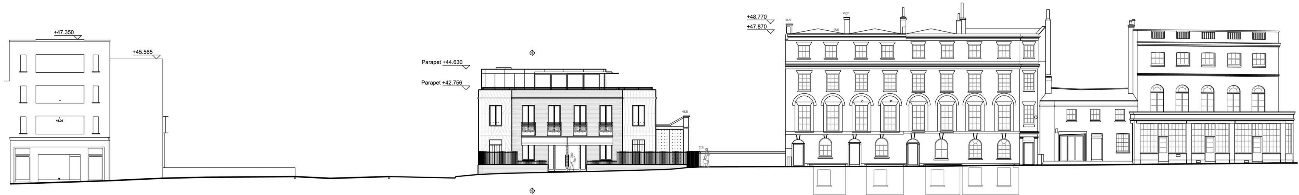
Scale 1.200 @ A1