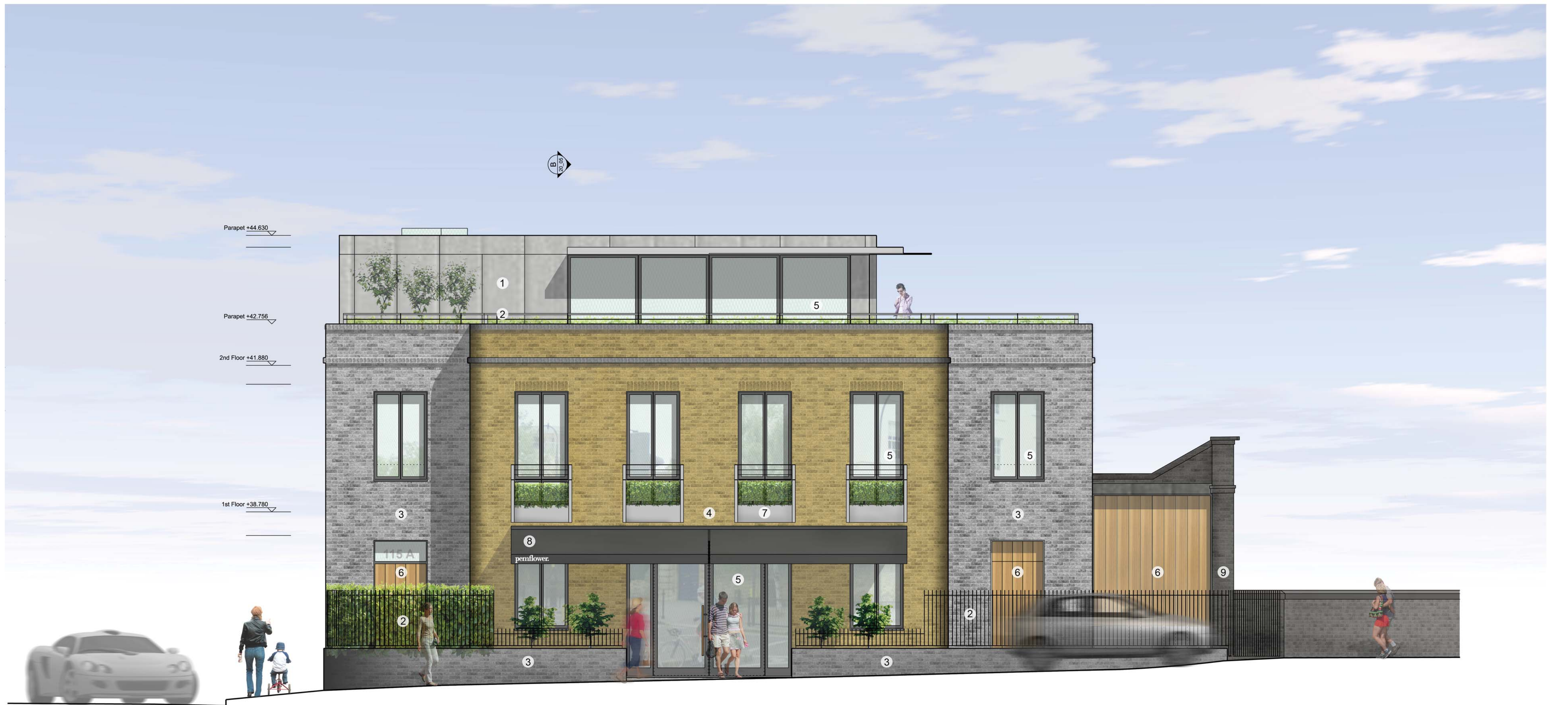
Scale 1.50 @ A1