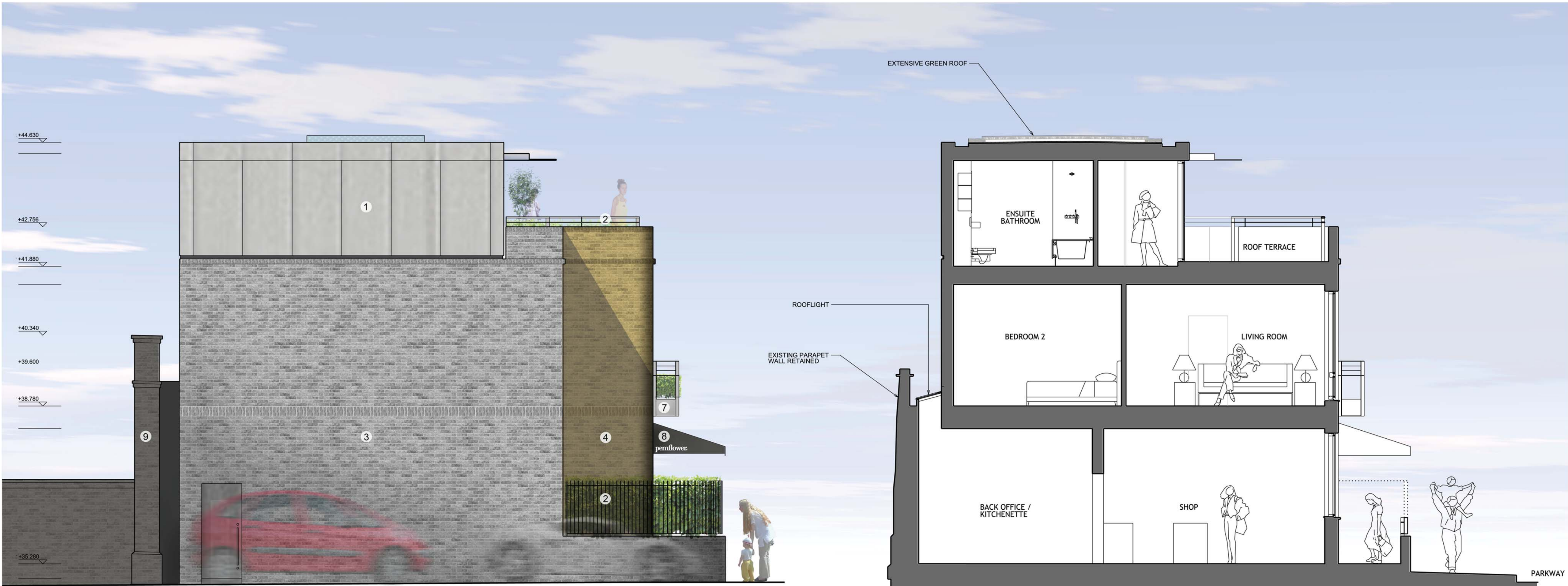
PROPOSED SIDE (NORTH EAST) ELEVATION