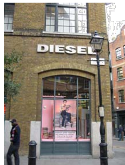
TYPICAL GROUND FLOOR WINDOW IMAGES OF EXISTING SHOP FRONTS