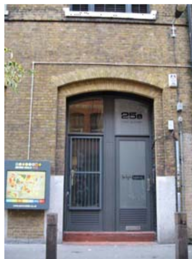
FIRE ESCAPE AND ENTRANCE TO 25A NEAL STREET