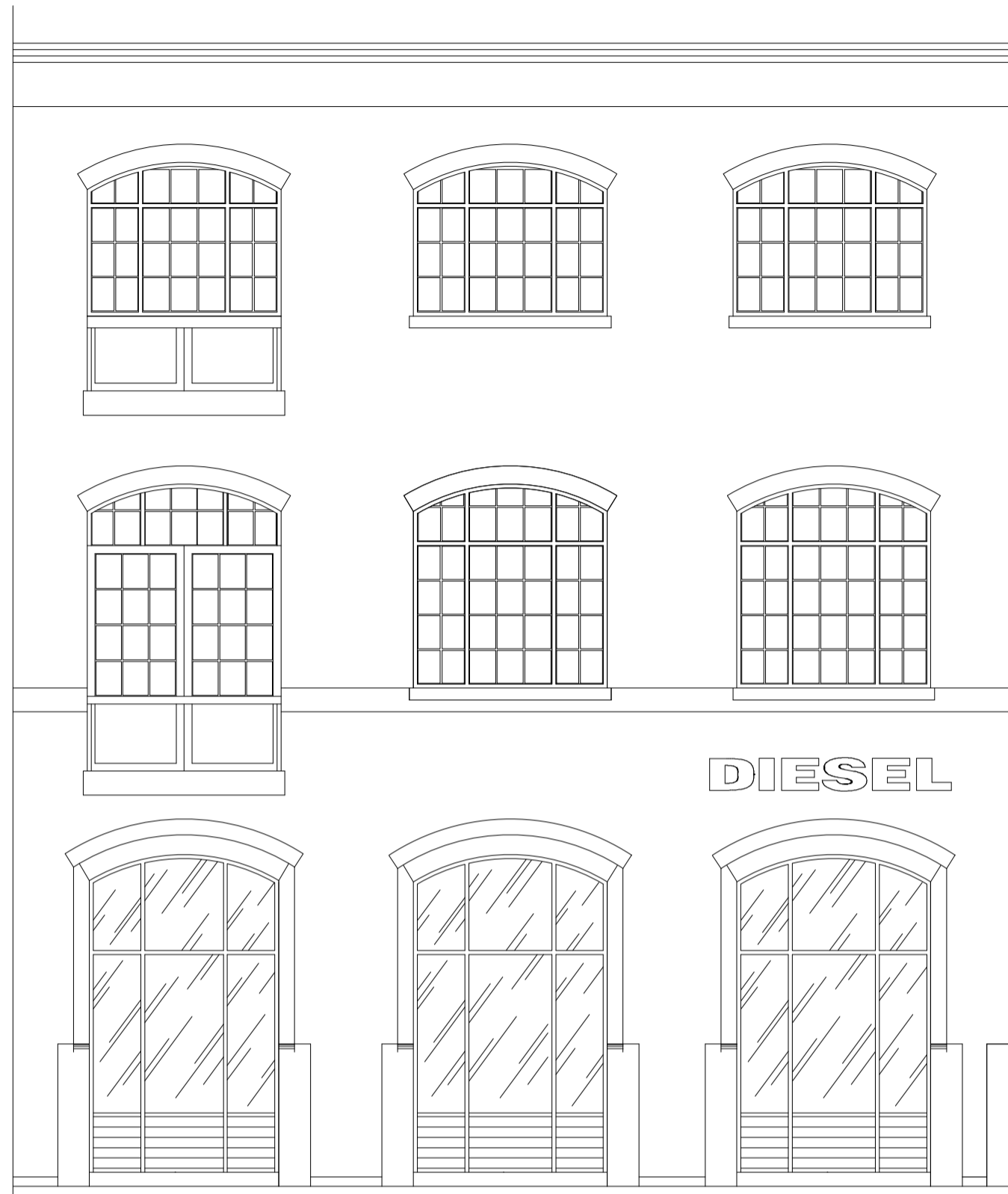
ELEVATION TO EARLHAM STREET