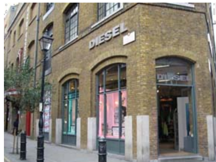
MAIN ENTRANCE AND EARLHAM STREET ELEVATION