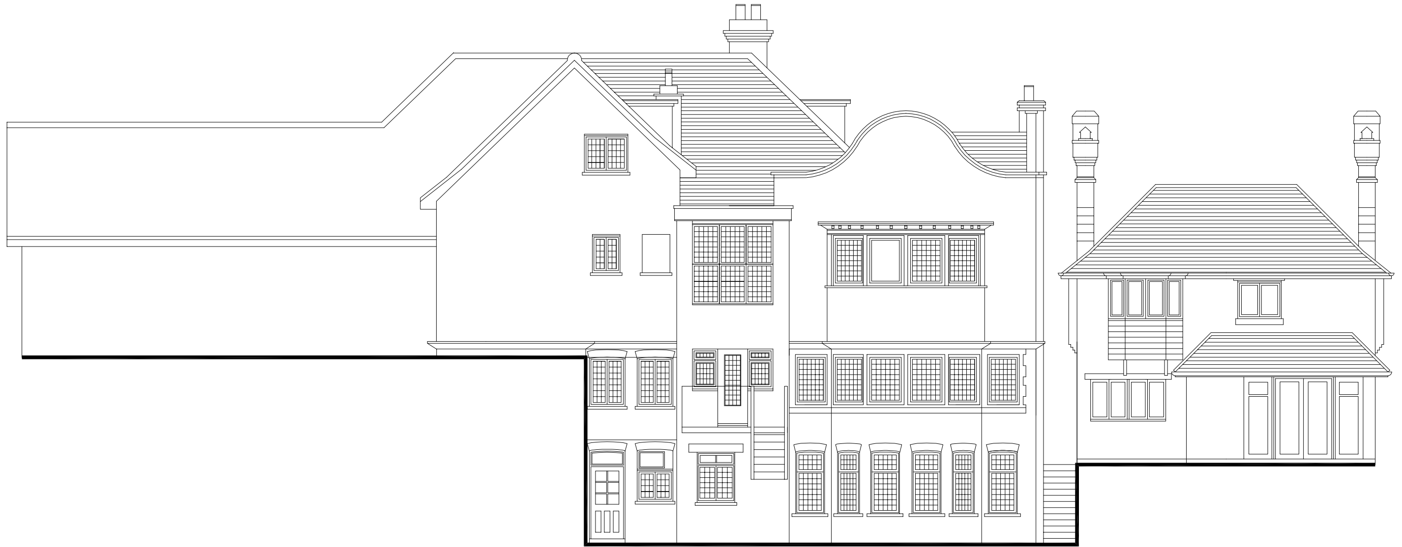
Rear elevation as existing