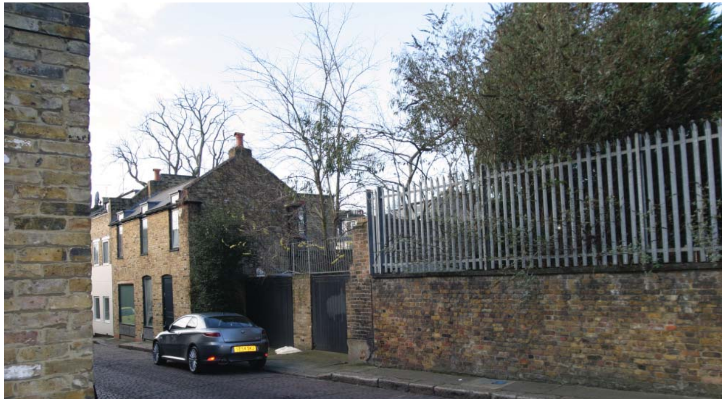
Fig. 1 Winter view of existing condition showing size and location of existing false acacia tree