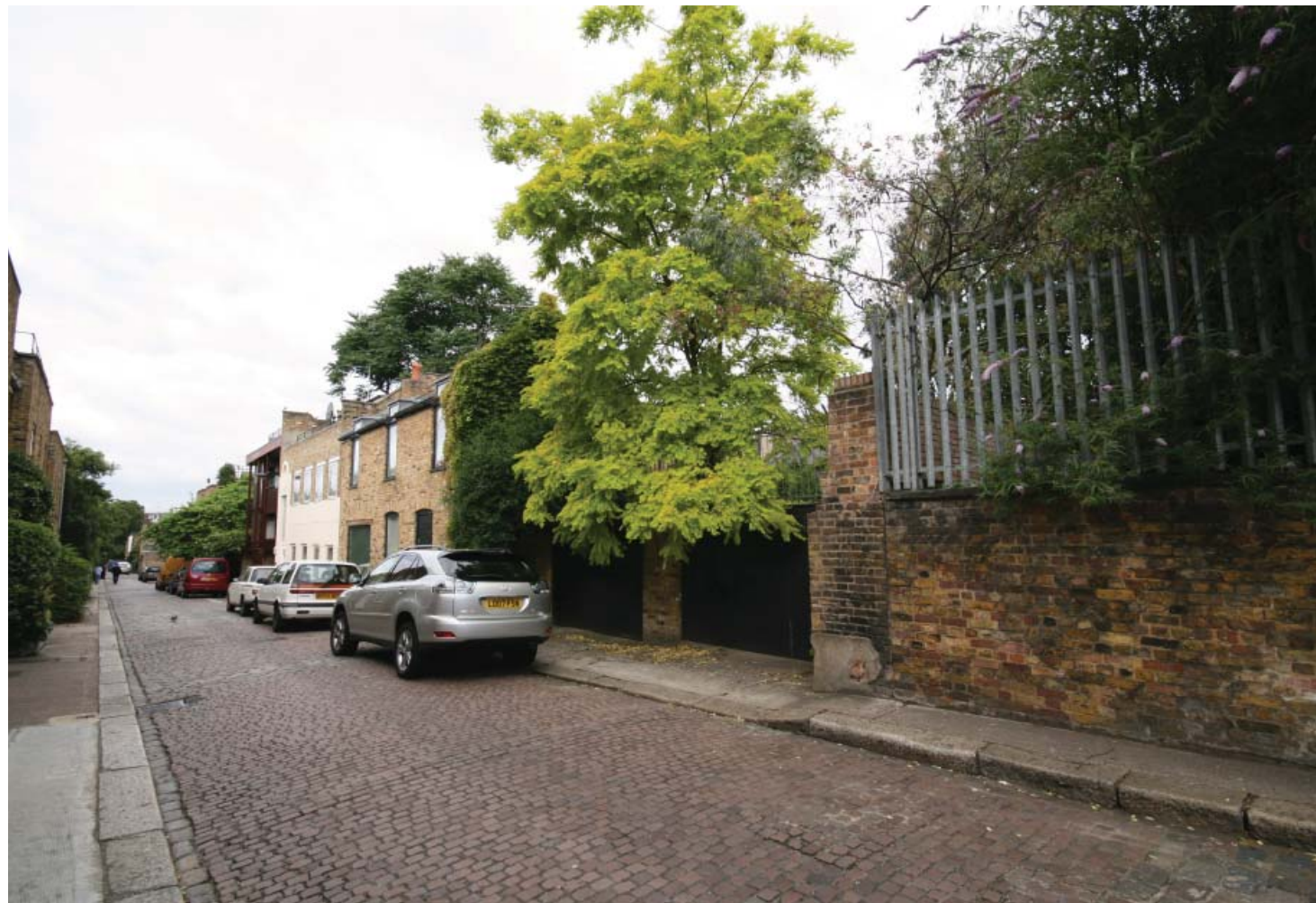
Fig. 2 Summer view of existing condition showing size and location of existing false acacia tree