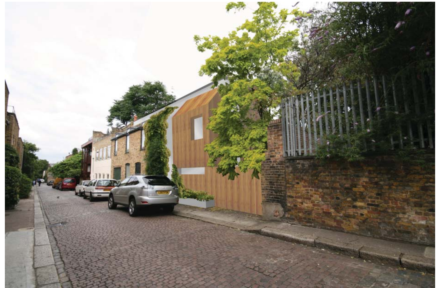
Fig. 3 Summer view showing location of proposed replacement planting in relation to street and extension