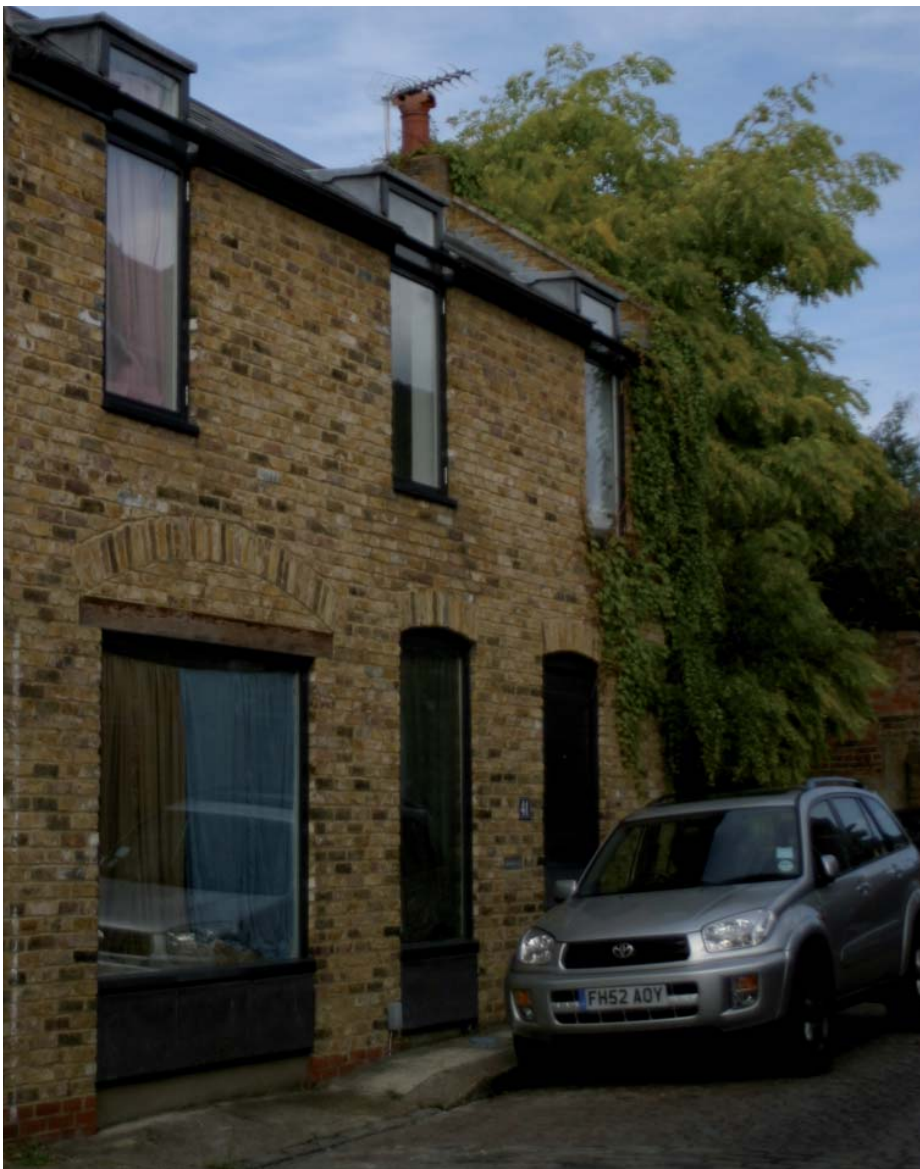
view of 41 camden mews showing existing materials: london stock brick, timber painted windows, eternit slate tiles & lead

All accesses arrangements to the property will be unaltered.