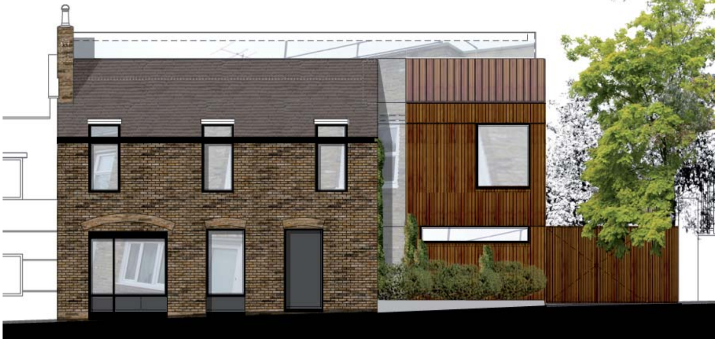
proposed street elevation

Materials for the proposed extension have been chosen to work sympathetically with the existing building and also to act as a foil to the traditional brick construction of the mews house. The choice of materials aims to create a lightweight contemporary building that is seen as subservient to the existing.