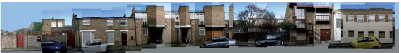
part elevation of camden mews showing mix of architectural styles