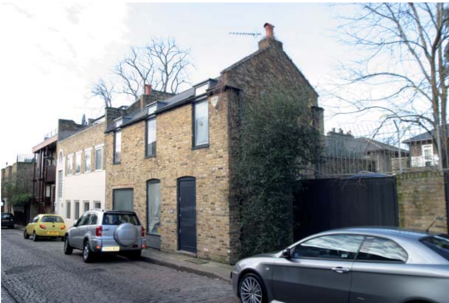
view of 41 camden mews

The house is part of a street scene that is varied in character ranging from original Georgian properties, period properties with modern interventions through to contemporary one-off house. This obvious variety creates a very distinct and appealing character.