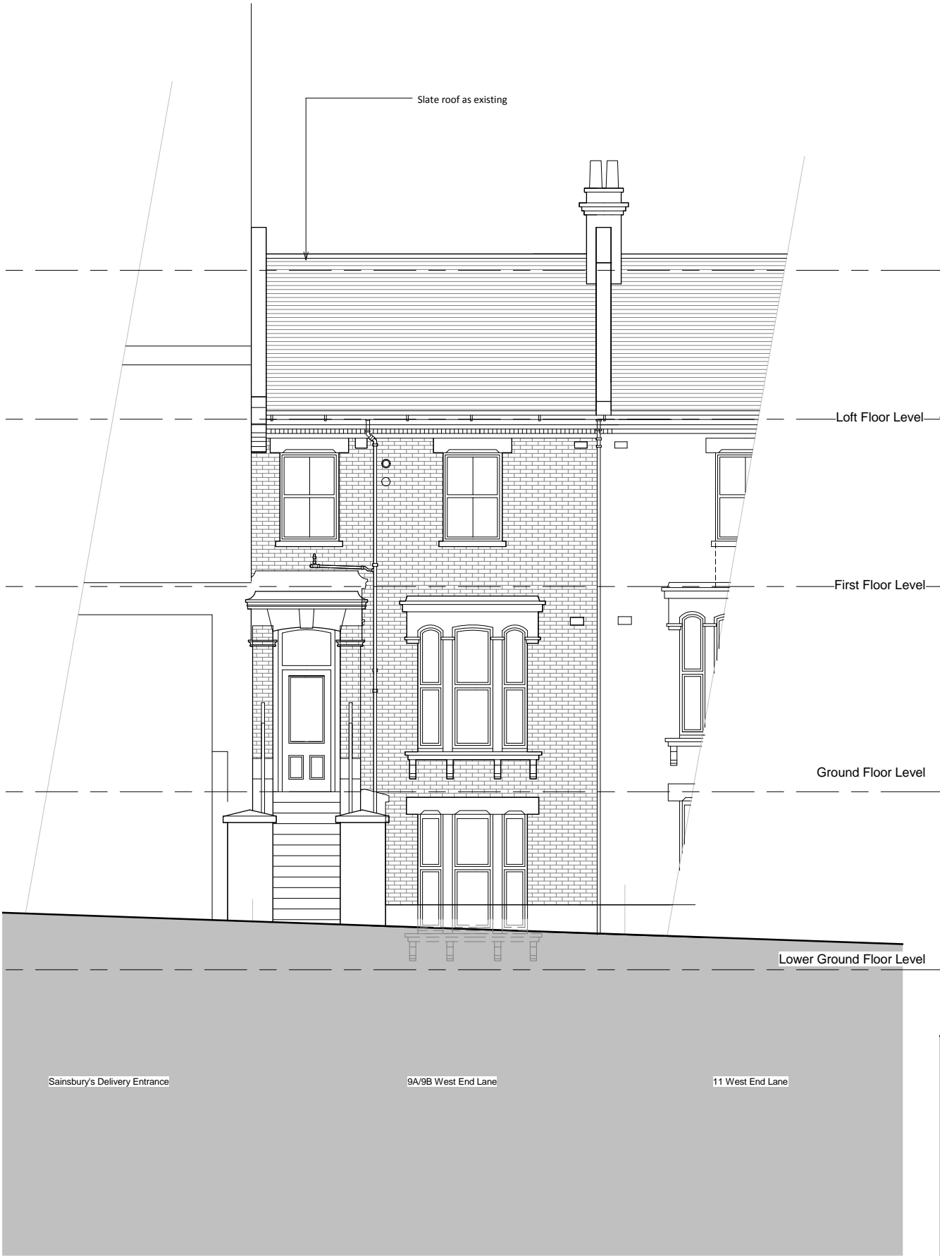
1 Existing South East Elevation 1 : 50