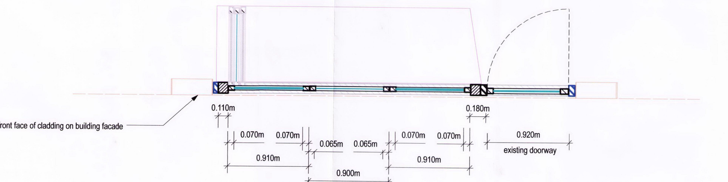
PLAN - MAIN NEW OPENING WINDOWS ABOVE NEW TRANSOM AND APPROVED SIGNAGE Scale: 1:25