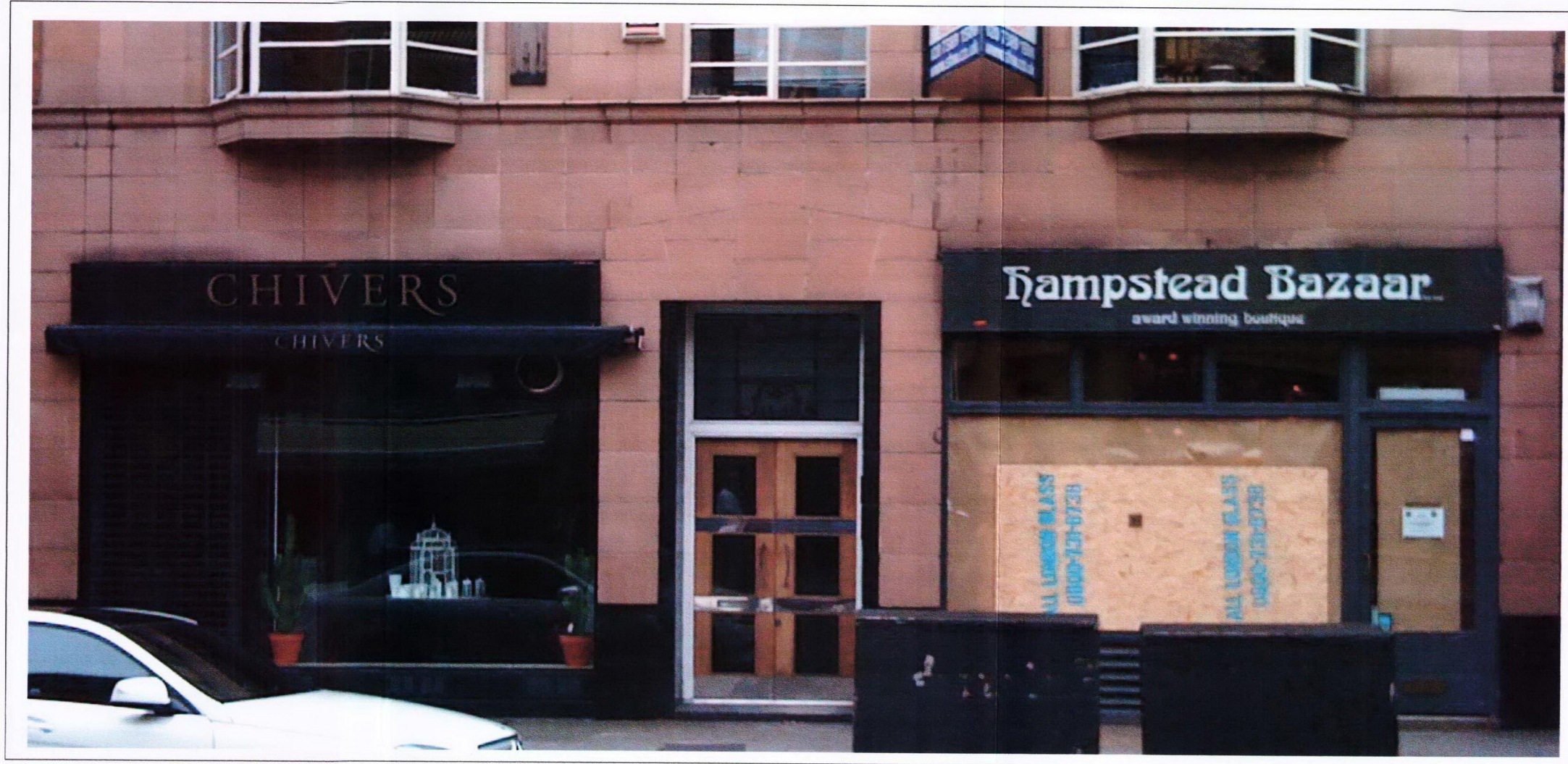
No 43 Charlotte Street CHIVERS No 45 Charlotte Street ORIGINAL FRONTAGE ( Damaged window and doorway - Rotten woodwork - required a total re-build )

Please note that Spacework Design Limited assumes that the enclosed design will be built to a satisfactory standard and cannot be held responsible for any construction or material failures during manufacture nor for any health and safety issues during site installation