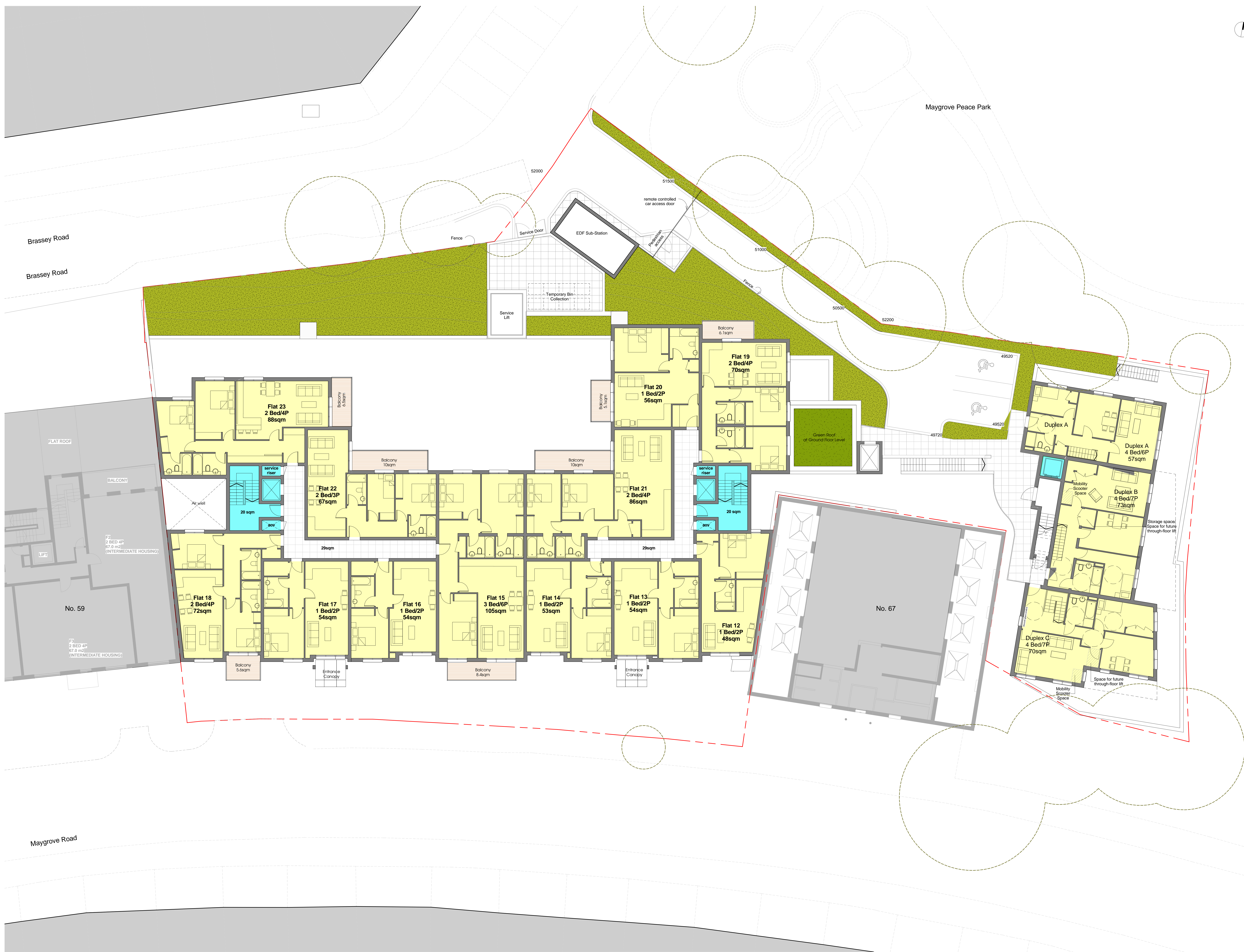
1 FIRST FLOOR PLAN 1 : 100