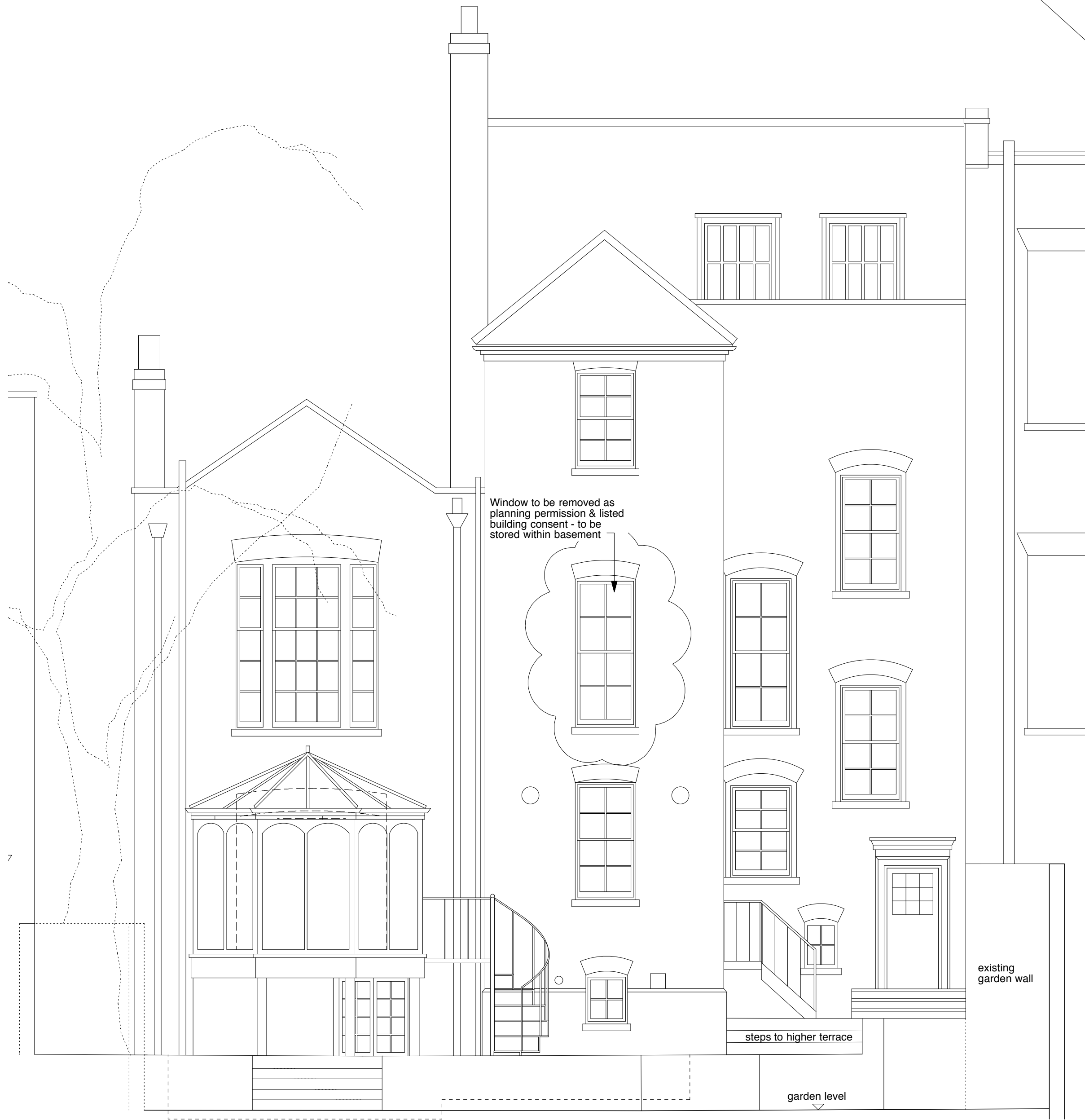
EXISTING REAR ELEVATION 17 POND STREET, NW3