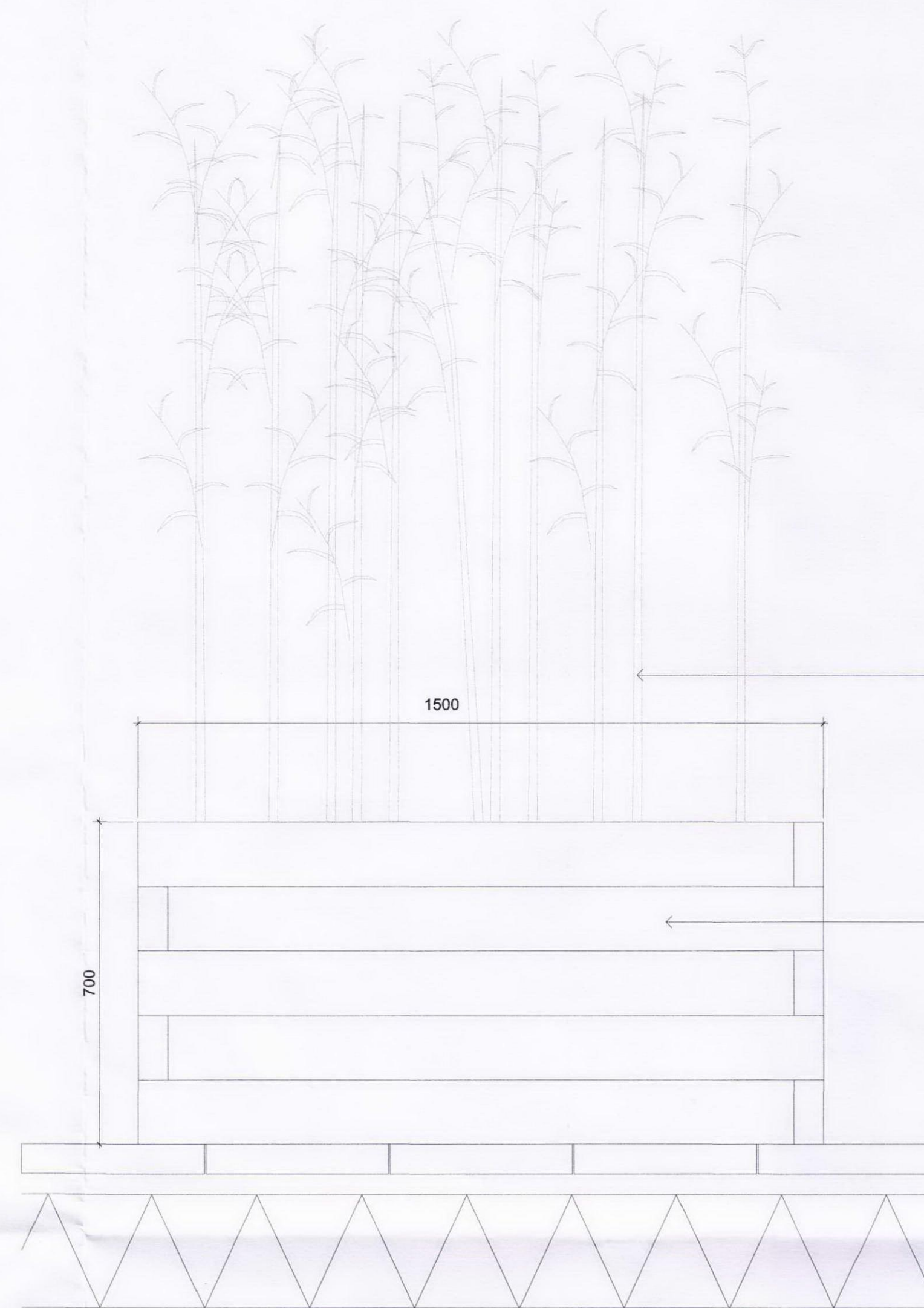
Raised Hardwood Timber Planter Elevation

Geotextile planter liner to specification clause Q31 298A attached to inside of planter with 25mm flat head galvanised steel tacks