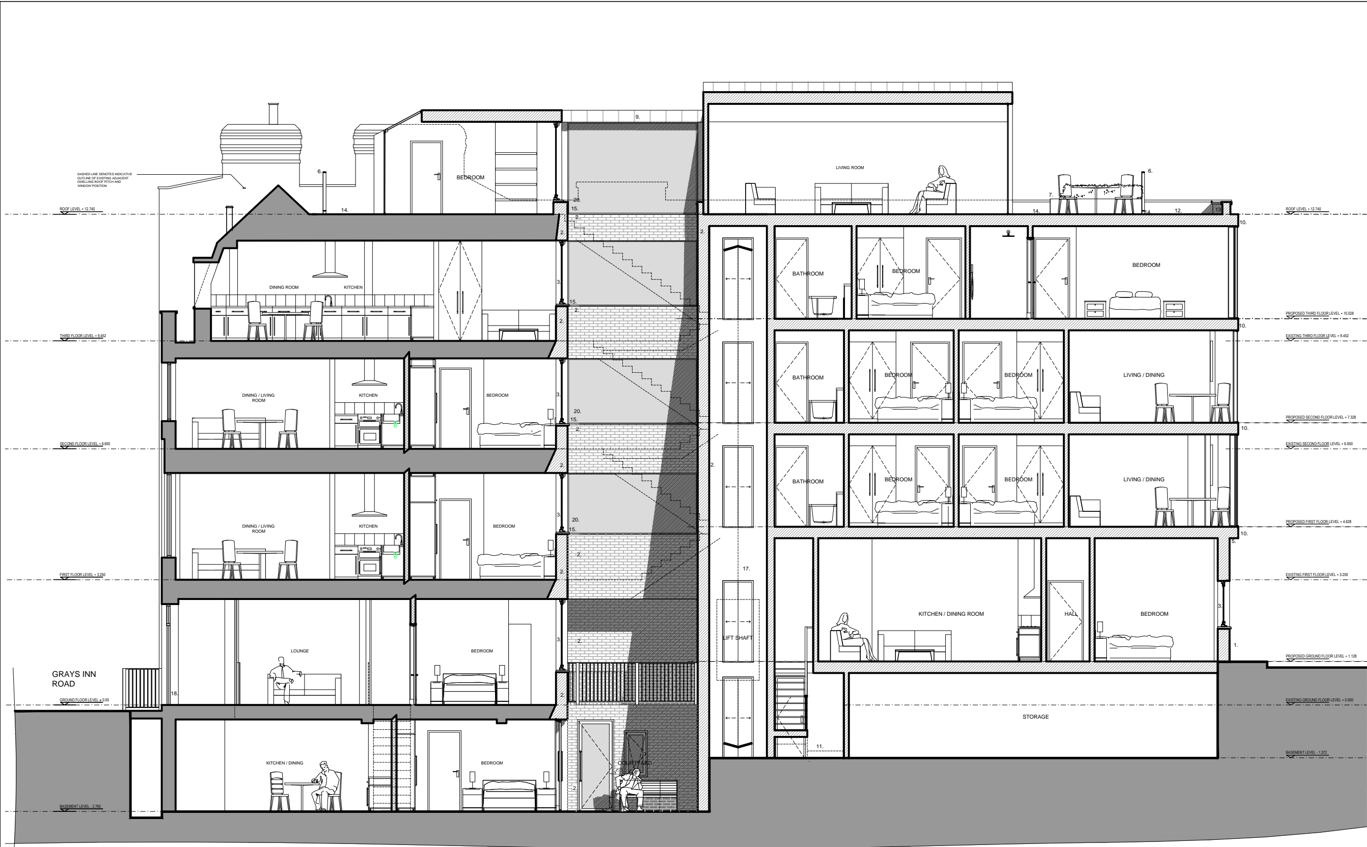
PROPOSED SECTION B - B SCALE 1 : 100