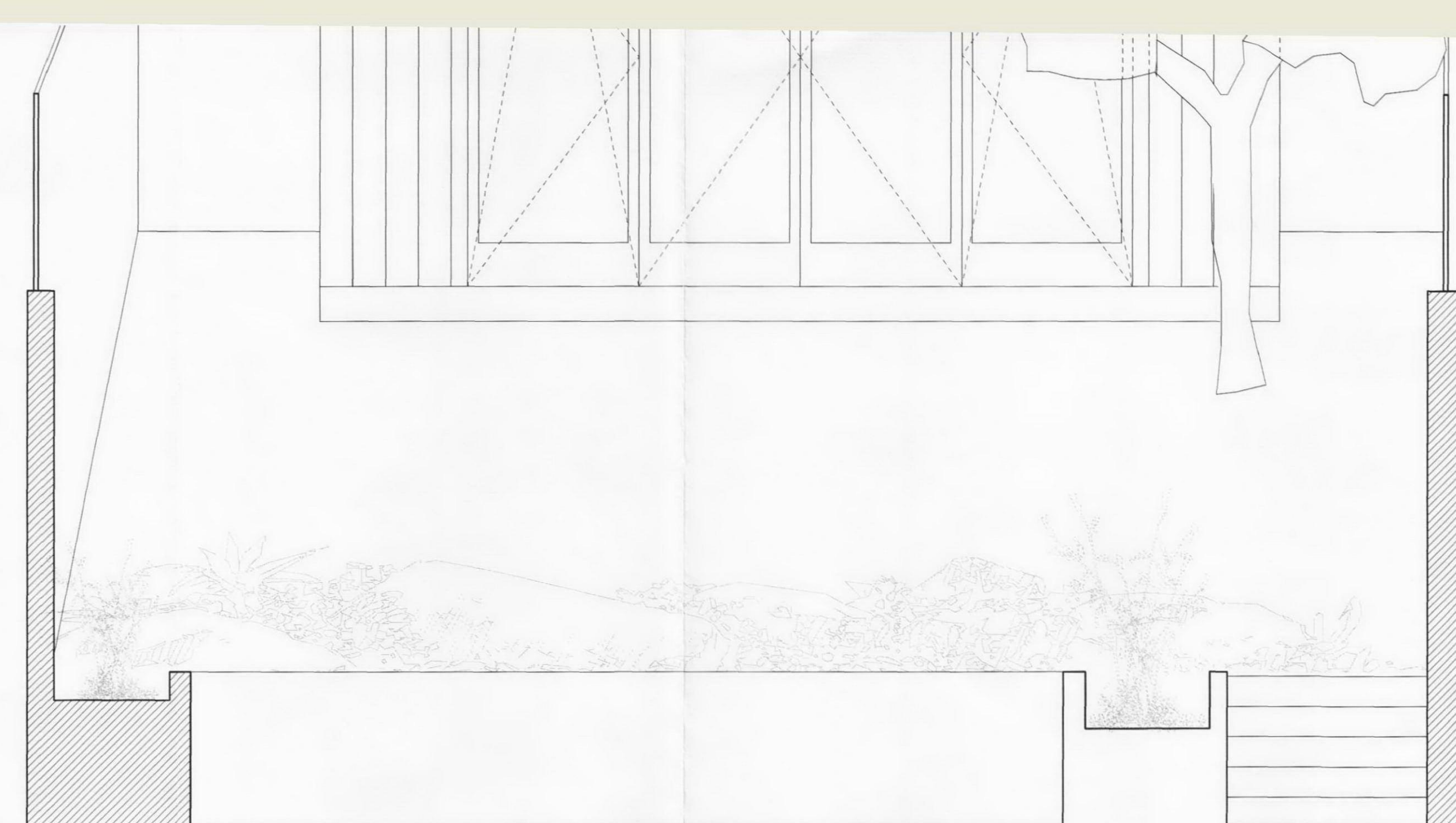
3 Elevation-Option 3 Scale: 1:20