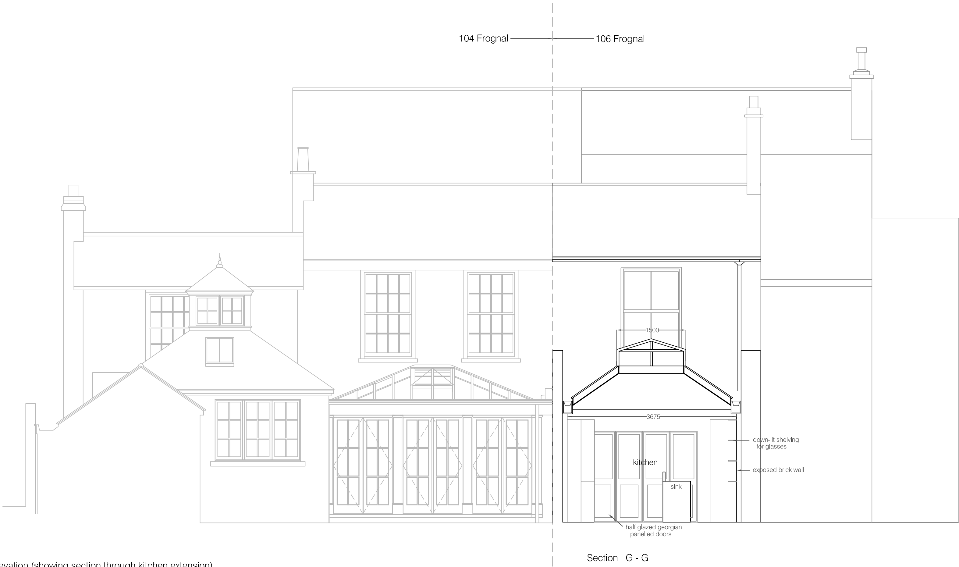
Rear Elevation (showing section through kitchen extension)