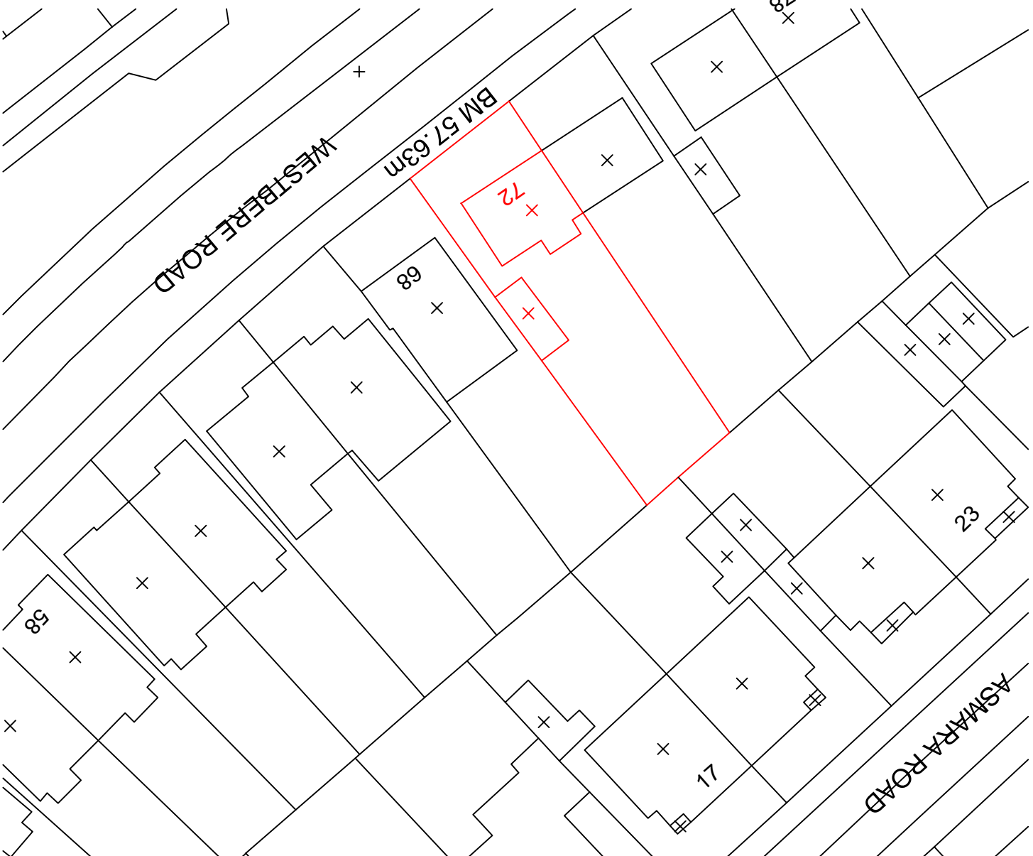
Block Plan-SCALE 1:500