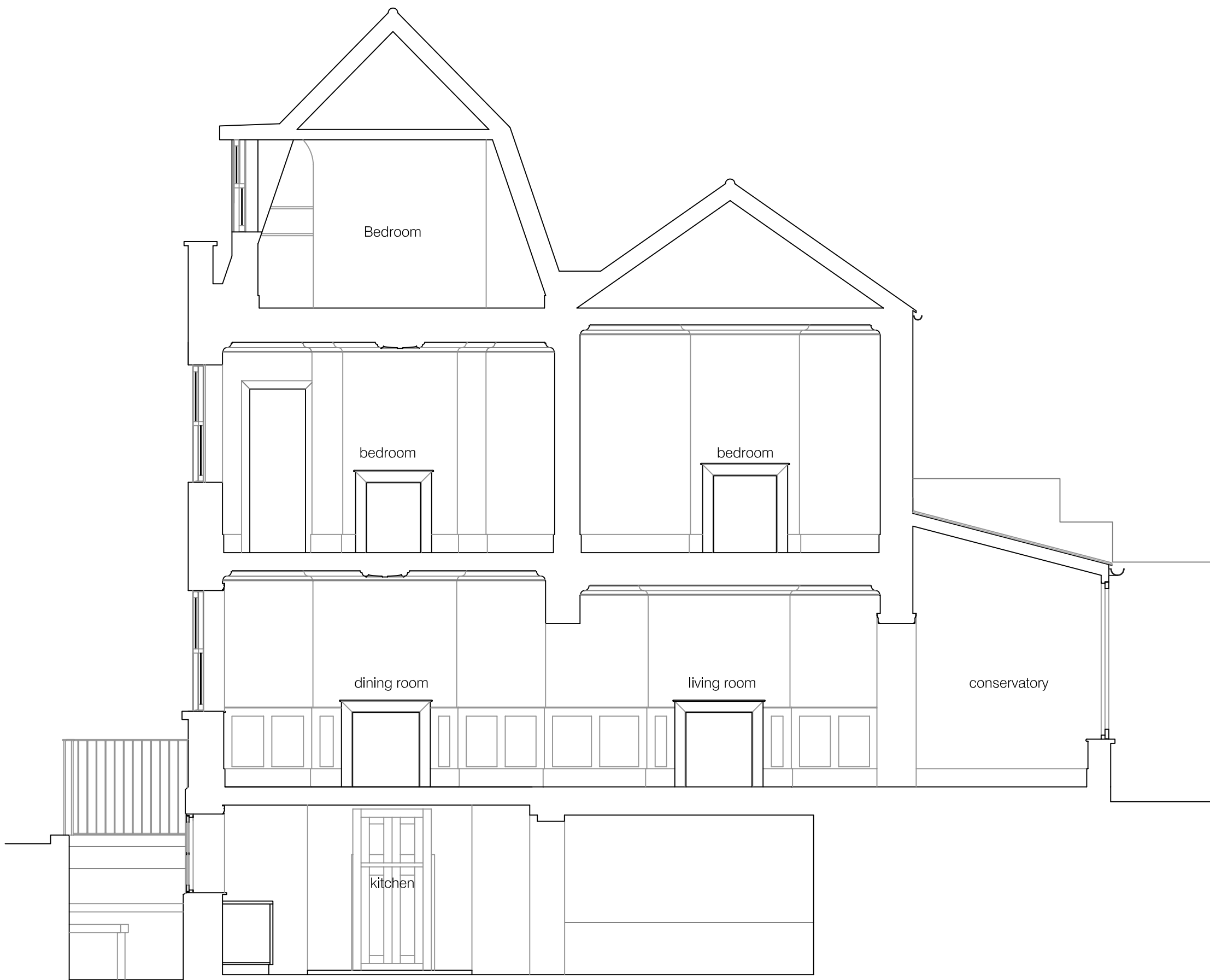
Section A - A