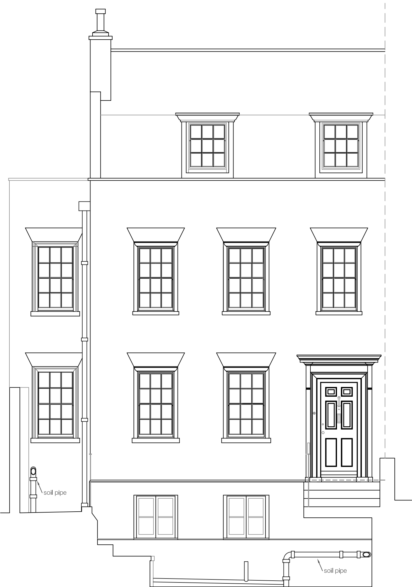
Front Elevation (showing basement level)