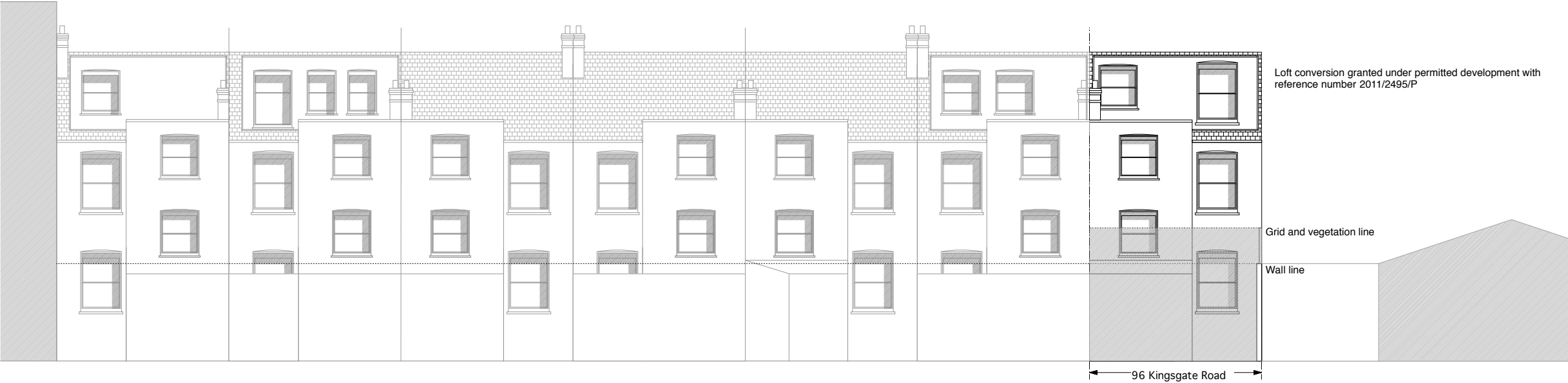
1 106 Elevation : Rear Elevation : Existing Scale: 1:150 @ A3