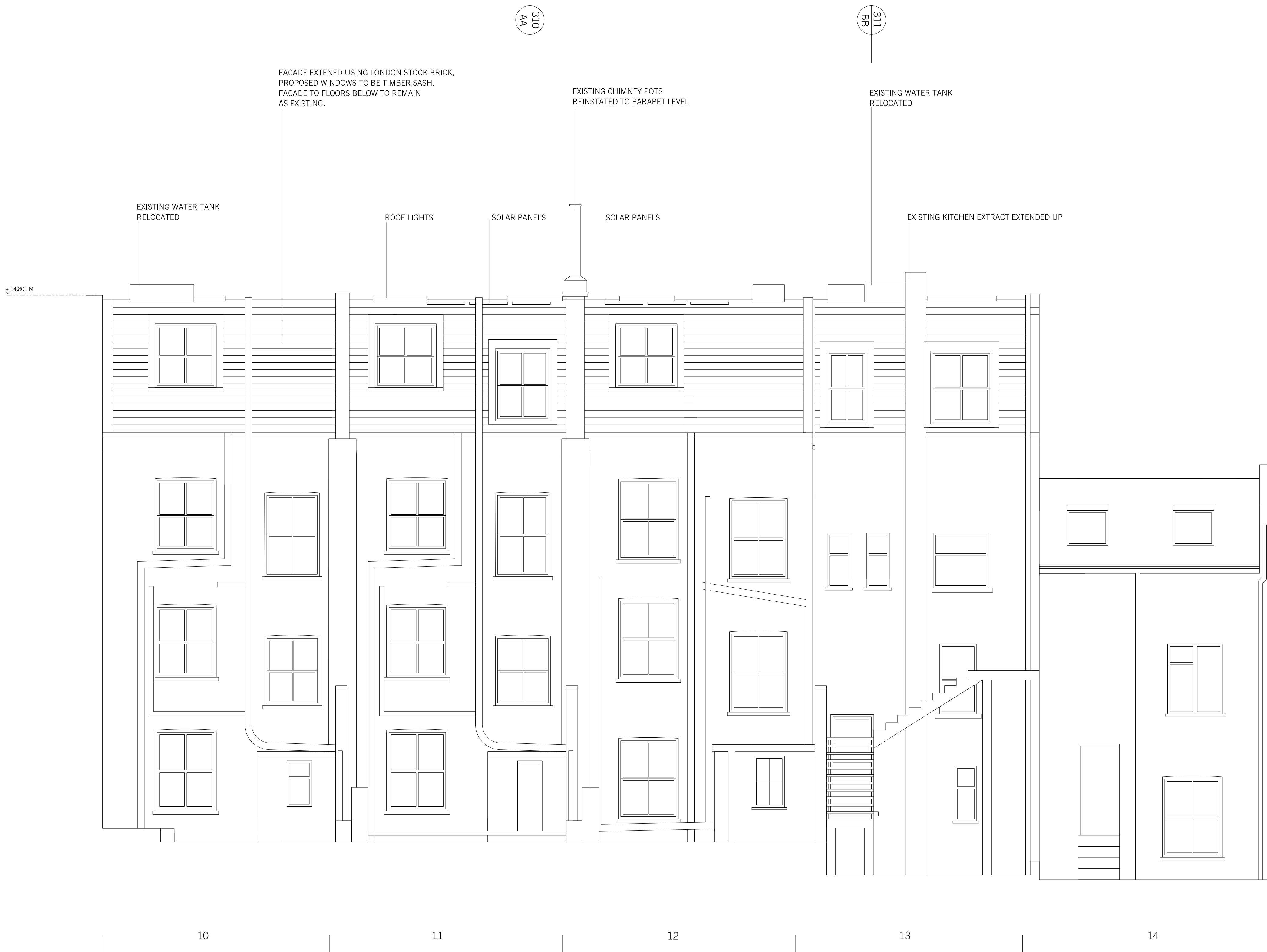
01: PROPOSED SOUTH ELEVATION SCALE 1:50