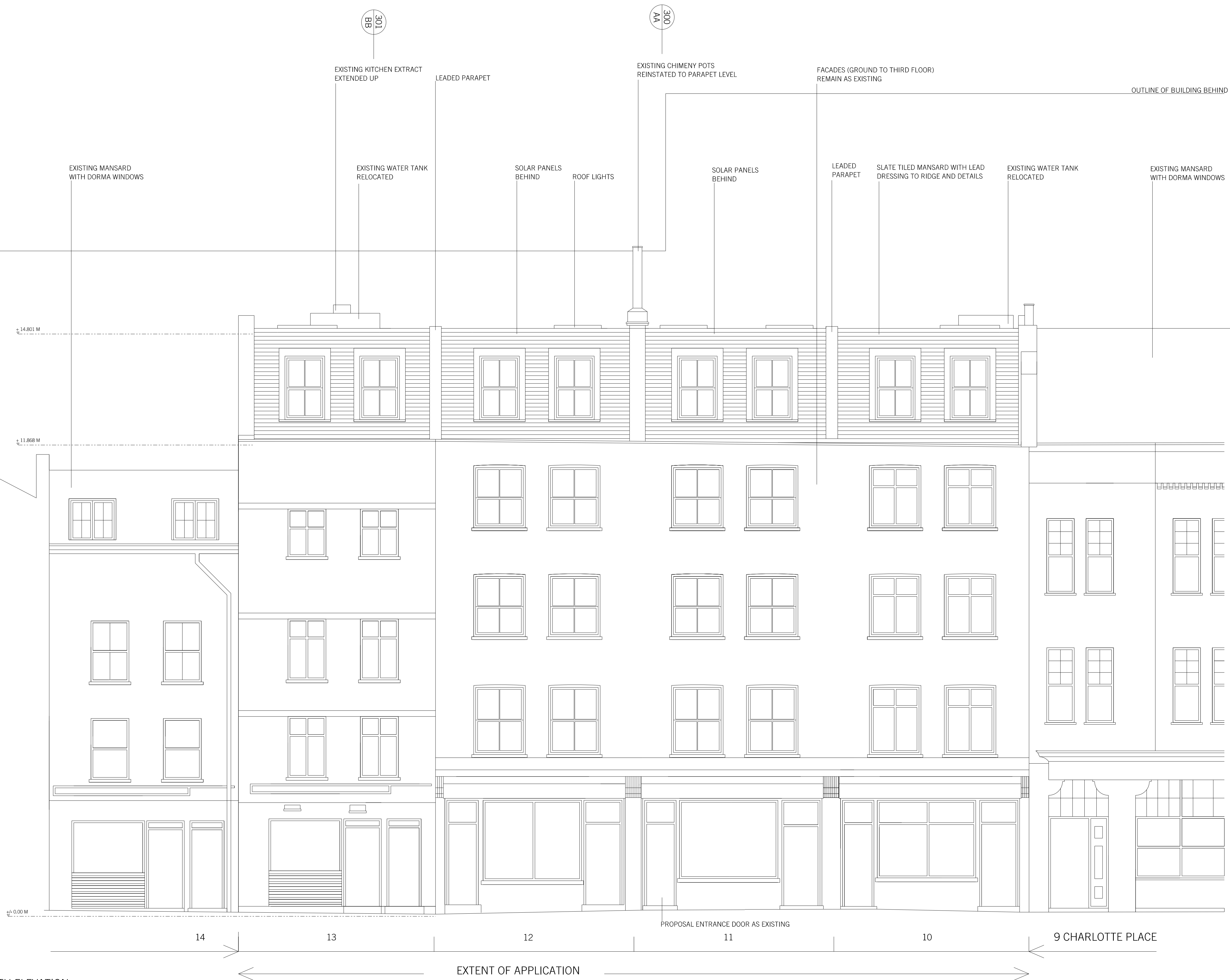
01: PROPOSED NORTH ELEVATION SCALE 1:50