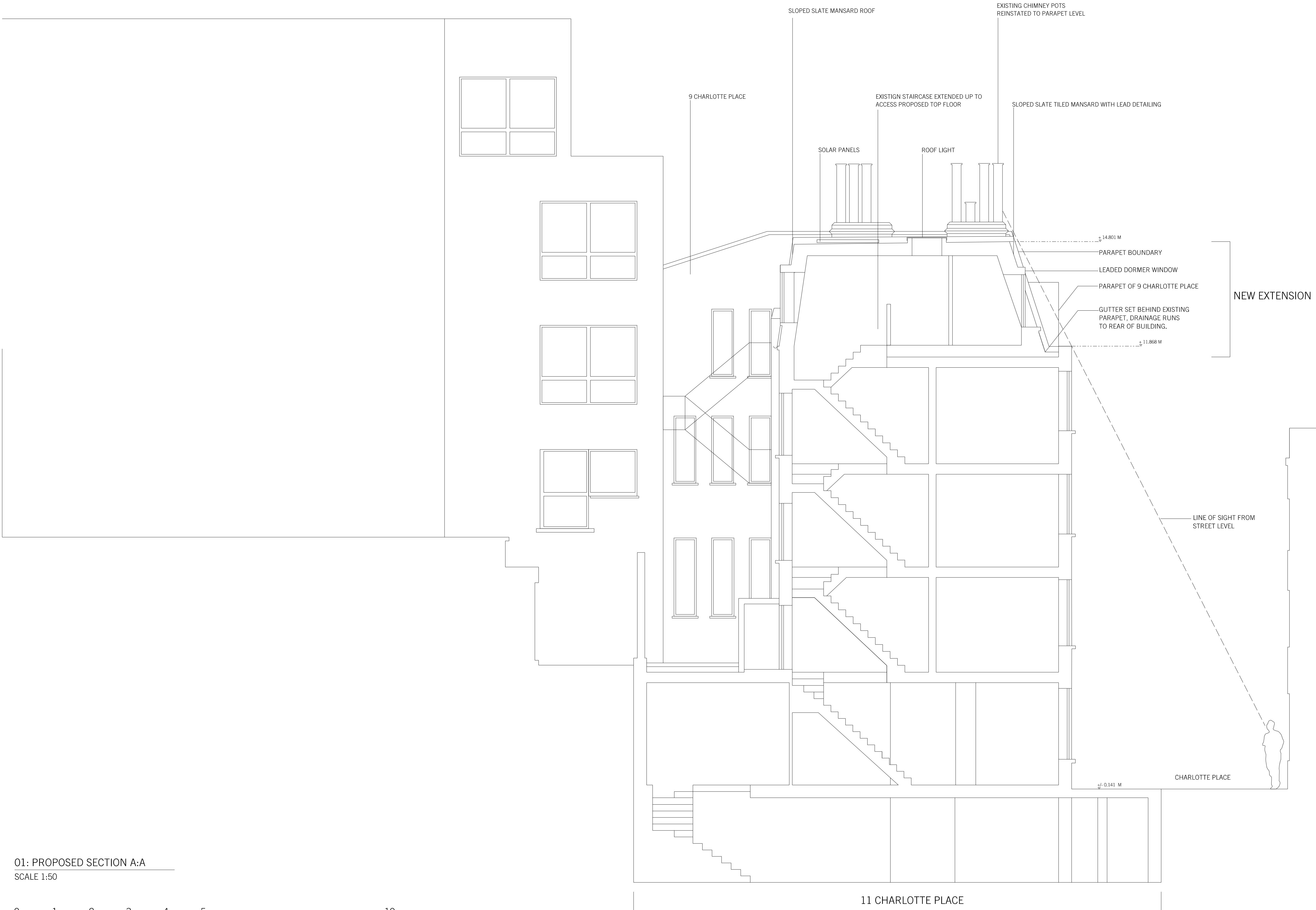
01: PROPOSED SECTION A:A SCALE 1:50