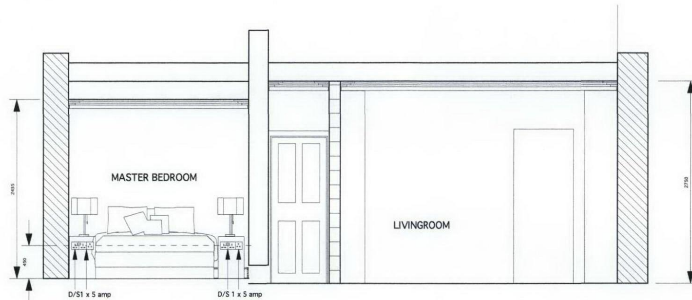
02 Proposed Section F-F