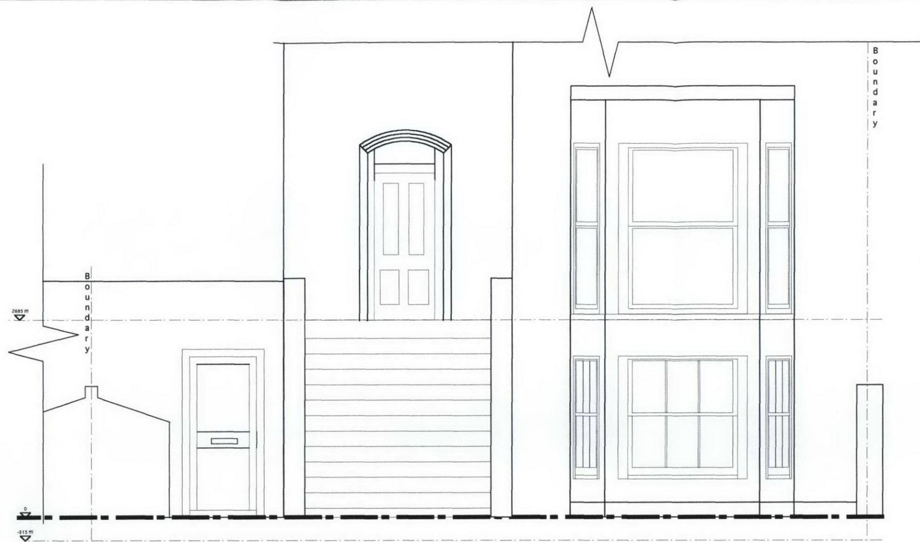
01 Proposed Front Elevation