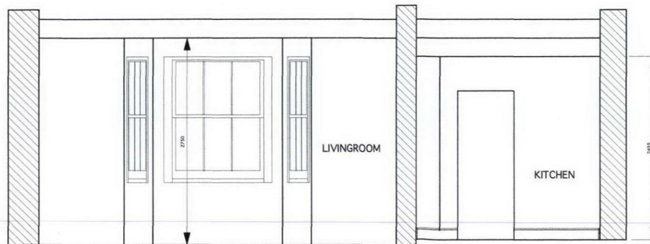
03 Existing Section G-G

Deverill-Jenkins Architectural Design Services