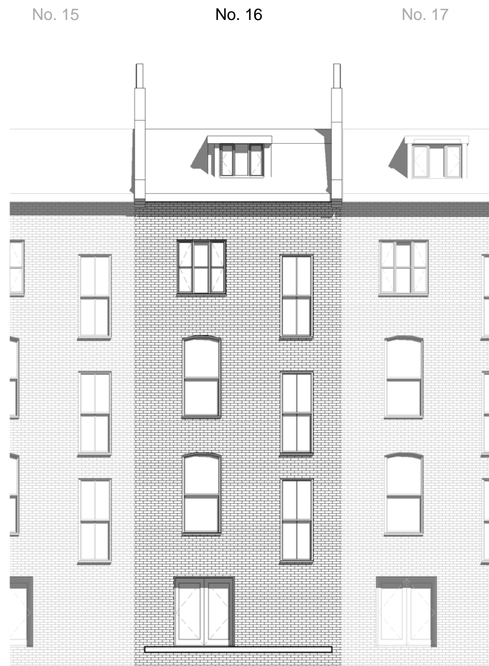
Rear Elevation - Existing