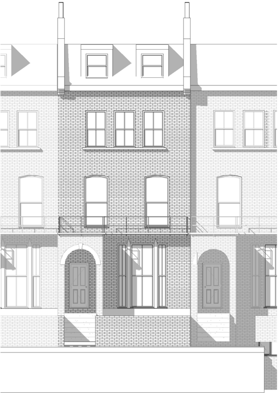
Front Elevation - Existing and Proposed