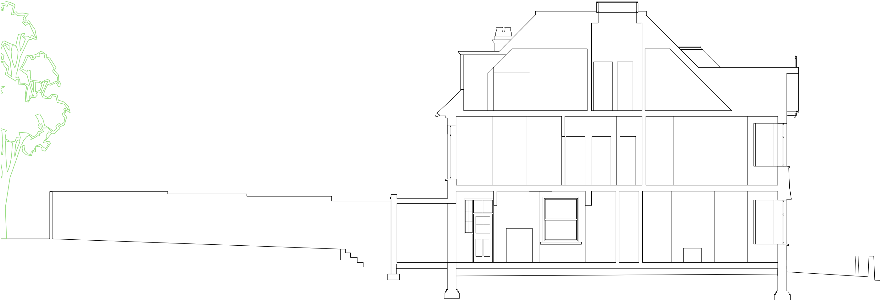
1 EXISTING SECTION A-A 1 : 100

THIS DRAWING AND ANY DESIGNS INDICATED THEREON ARE THE COPYRIGHT OF THE ARCHITECT. ALL RIGHTS ARE RESERVED. NO PART OF THIS WORK MAY BE REPRODUCED WITHOUT PRIOR PERMISSION IN WRITING FROM THE ARCHITECT.